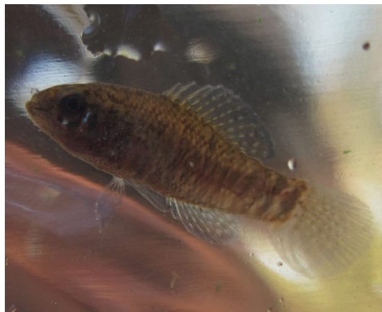
Carolina pygmy sunfish