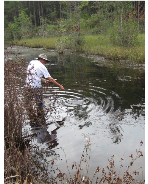
Surveying for Carolina pygmy sunfish on Honey Island Swamp, a tributary to Juniper Creek

grate with flow to take advantage of ephemeral conditions inherent to the cypress swamps and roadside ditches they prefer. Local densities remain relatively high in available habitats. In addition, staff found new localities for several other priority species, including the banded sunfish and the golden topminnow. The latter continues to expand its range northward through the Waccamaw River drainage. Staff will continue to monitor Carolina pygmy sunfish populations and will submit study results to the U.S. Fish & Wildlife Service in 2016.