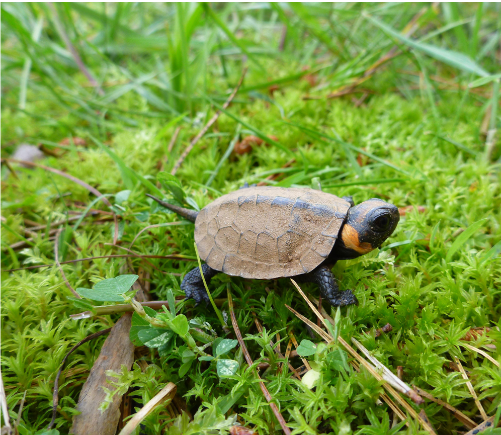
Juvenile bog turtle.

Among the key speakers were researchers who are looking at bog turtle-related issues, such as genetics, movement, habitat use and wetland hydrology. The meeting provided a great opportunity for researchers to share information with the group and each other, and PBT hopes the communication and sharing that come from these meetings will lead to more effective conservation actions on the ground.