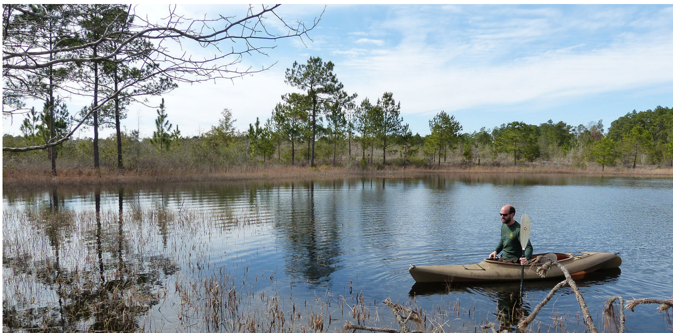
A Wildlife Diversity Program biologist conducts amphibian egg mass surveys at an open-canopy isolated wetland.

These results, coupled with data on vegetation, hydrology, and macroinvertebrate assemblages, will be published in a final report and submitted to a peer-reviewed journal during the next year.