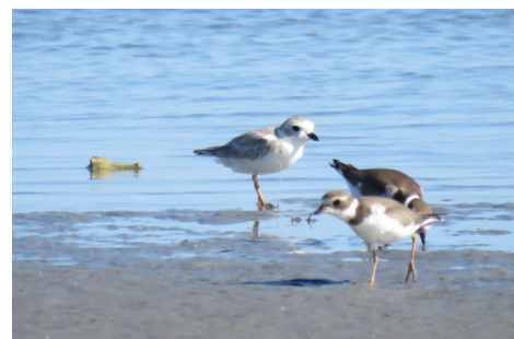
Piping plovers and semipalmated plovers use shoals and mud flats as foraging habitat during fall migration. One piping plover was detected on each of two surveys, of four surveys conducted during fall migration.