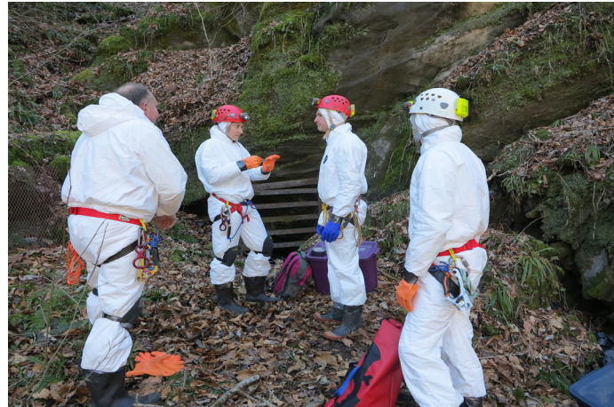
Surveyors prepare to conduct a winter bat survey using decontamination equipment to minimize the spread of WNS.

tri-colored bat. Further analysis will indicate the degree of decline for these species.