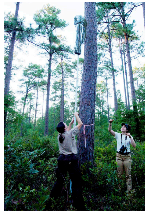
Raising a net to capture a roosting red-cockaded woodpecker

The Wildlife Commission will continue to provide technical assistance in monitoring this population and has taken a lead role in producing a draft management plan.