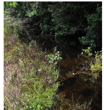
Juniper Creek