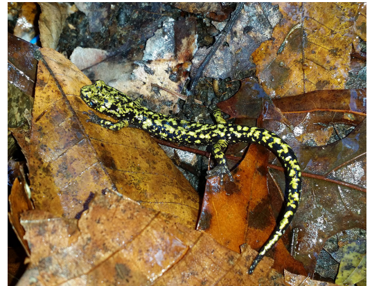
A significant, new population of state endangered green salamander was found in 2015, Macon County.