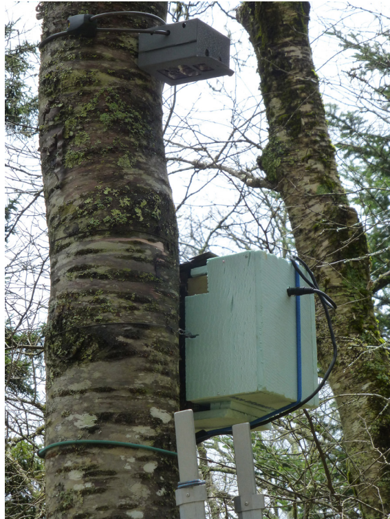
Anechoic chamber and trail camera set up around an occupied nest box

Staff recorded 10 trill calls from juvenile Carolina northern flying squirrels during the mid-April trial and obtained images of the mother and pups. Though similar in structure to the adult trill, the juvenile trills were strongly ultrasonic (22-55kHz), which would make the calls inaudible to most predators. The “delta frequency” value was also much larger for the juvenile trills than the adult trills. Biologists also recorded several unfamiliar calls from the pups.