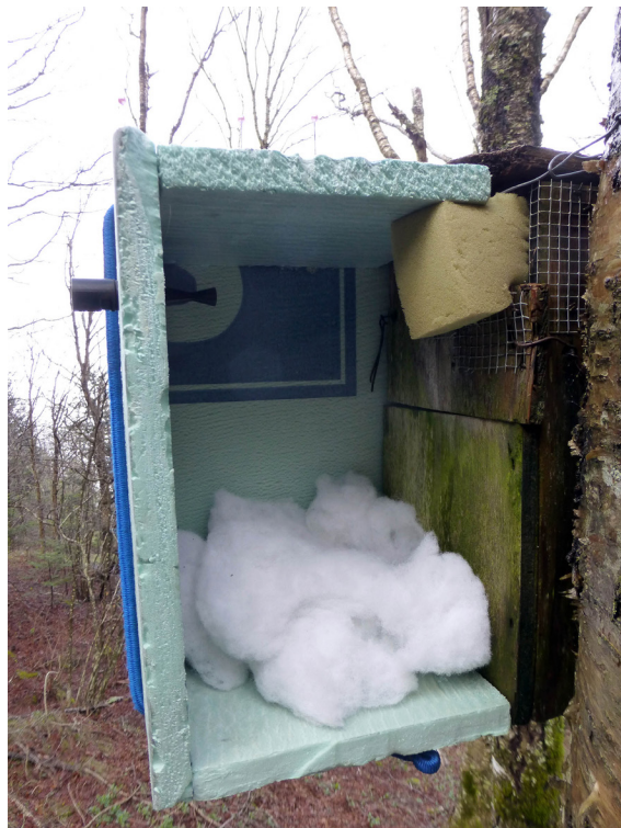
Interior view of anechoic chamber and microphone with side wall removed