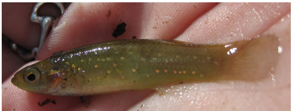
Golden topminnow