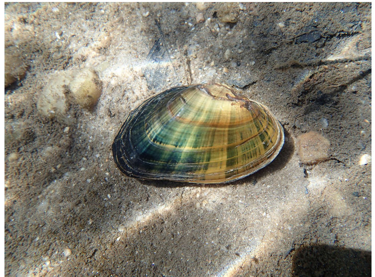
A state-endangered brook floater found in Mulberry Creek. This population was newly discovered in October and is likely one of the largest in the state.

a newly discovered population in Mulberry Creek that is likely one of the largest in the state. Additional surveys in Upper Creek, Wilson Creek, and Linville River extended the known range of this species in each stream. Next year, biologists plan to continue brook floater surveys and monitoring in the upper Yadkin-Pee Dee river basin.