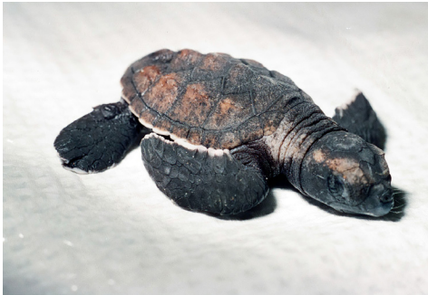
Newly emerged hawksbill sea turtle hatchling from Brazil. Hatchlings of loggerhead and hawksbill sea turtles share similar size and coloration, but hawksbills have four pairs of lateral scutes on the carapace, while loggerheads have a small fifth pair, near the shoulders.

These nests surprised Wildlife Commission biologists because hawksbill sea turtles are primarily tropical and subtropical, generally found in marine and coastal areas between 30° S and