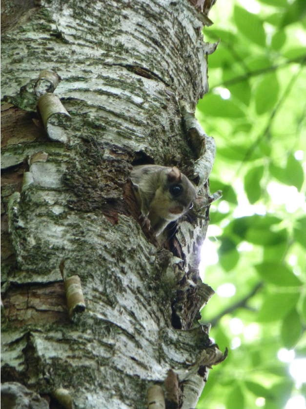
Carolina northern flying squirrel