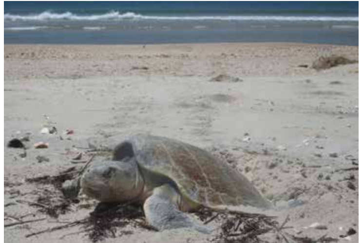
Kemp's ridley nesting on Shackleford Banks

was only the 10 th known nest laid by this species in North Carolina. Although most species of sea turtles nest at night, Kemp's ridleys are known for nesting during the day.