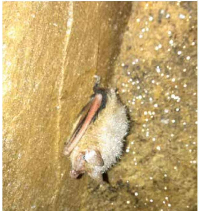
No evidence of white-nose syndrome was found in bats in the Uwharries.

Over the winter, Wildlife Diversity Program staff surveyed and sampled six potential hibernacula in the Uwharries, which is located in the central Piedmont. Of these, four hibernacula had tricolored bats hibernating, and one hibernaculum also had big brown bats. Both of these species are being impacted by white-nose syndrome in the mountains and in other eastern states. It is encouraging to find healthy bat populations, albeit in small numbers, hibernating in the Uwharries. The most bats found in one site were eight individuals. Monitoring of these populations will continue and, biologists hope, expand next winter.