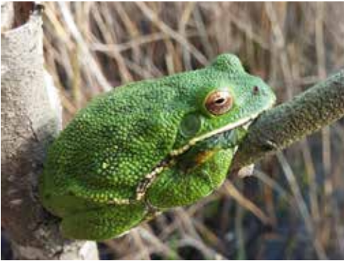
Barking treefrog found during training workshop at Carolina Beach State Park

of Natural Sciences Teacher Trek in Croatan National Forest, Cool Springs Environmental Education Center, N.C. State University Roots & Shoots Club. Other workshops included a training session at Carolina Beach State Park, the N.C. Herpetological Society spring meeting and the N.C. Forestry Association's Teachers Tour in Croatan National Forest.