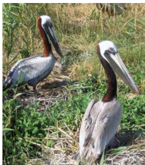
Brown pelicans on nest