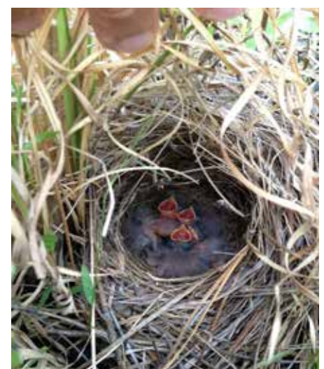
Bachman's Sparrow Nestlings