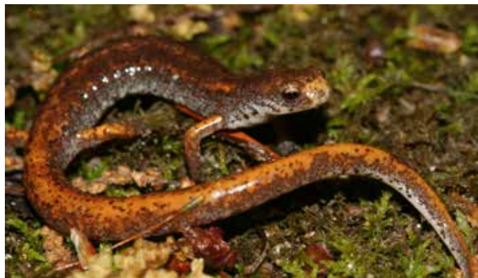
During recent surveys in eastern North Carolina, Wildlife Diversity Program staff found several priority species, including (clockwise from top left) a chicken turtle, a four-toed salamander, a spotted turtle and a northern scarlet snake.