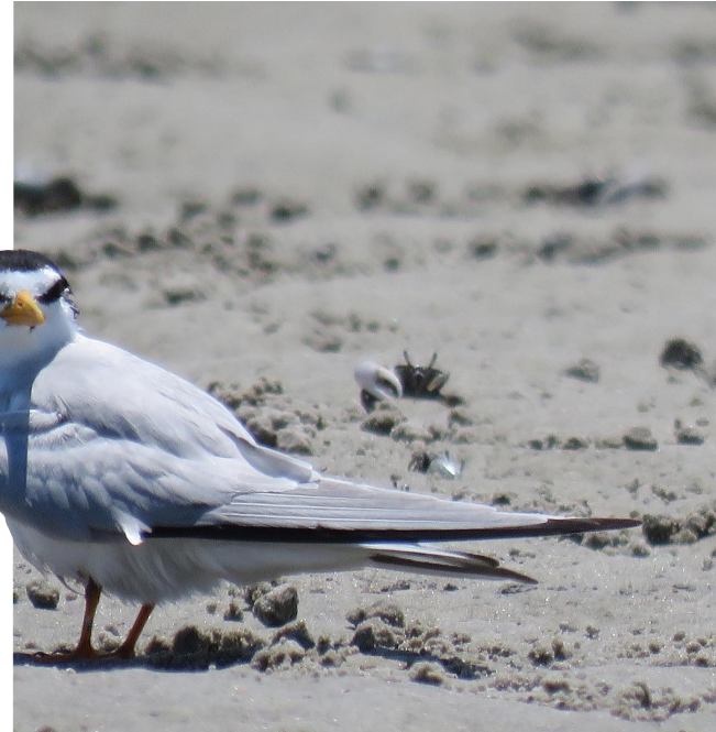
Least tern

During the summer, temperatures on rooftops can be high, and an ordinary roof provides little to no shade. The shadows cast by the blocks will give chicks a place to escape the blazing heat. In 2017 the tern turret had 18 nests, which grew to 24 nests in 2018. This year, staff from the aquarium and the Wildlife Diversity Program will monitor the colony’s success via eight cameras that have been strategically placed around the roof.