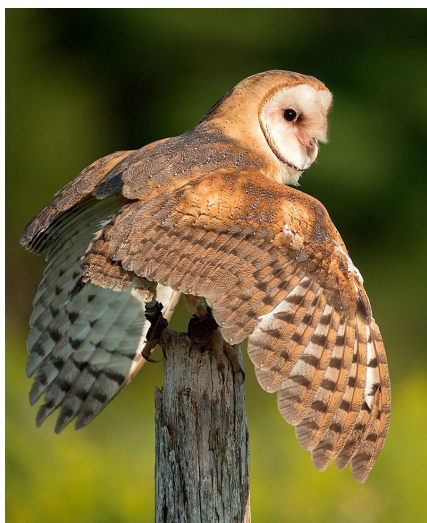
Barn Owl

In 2012, the New Hope chapter of the Audubon Society started installing Barn Owl nest boxes in areas with appropriate habitat, but none of the 27 boxes have been occupied. The chapter has been helpful with the continuing expansion of the project through word-of-mouth with landowners and equipment loans of nest cameras and nest boxes. The chapter also has been publicizing the project on its website .