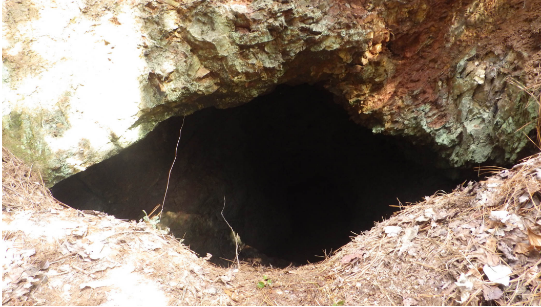
The entrance to an inactive gold mine in which 18 hibernating tri-colored bats were counted

Nine of these mines were surveyed in winter 2019 yielding a total of 86 tri-colored bats, 30 of which hibernated in a single site. This count is slightly greater than the highest counts in Mountain hibernacula, some of which formerly held thousands of tri-colored before the arrival of WNS. Fungal swabs were collected from each Piedmont site to test for the causative pathogen of WNS and results are pending; however, sites that tested positive for this pathogen in the past continue to show stable counts and visibly healthy bats. This could be an indication that WNS is unable to grab a foothold in the Piedmont Region, perhaps due to the warmer, shorter winters that provide small amounts of insect activity for bats to re-build their fat reserves. The explanation for continued health among these tri-colored bats remains unclear, but one thing is for sure, NCWRC biologists are finding inactive gold mines now hold a different kind of treasure.