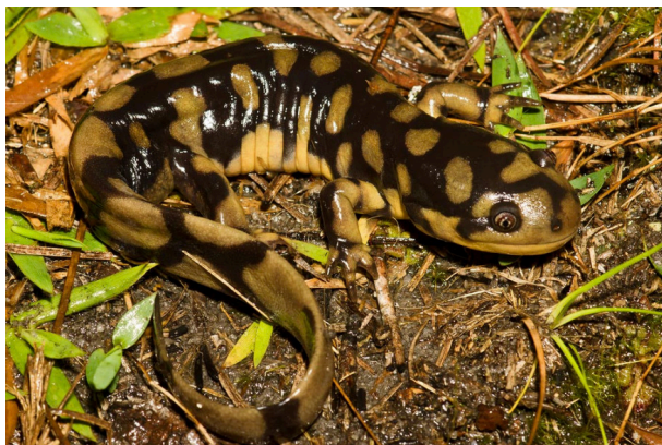
Tiger salamander

As of 2019, they have now documented tiger salamanders breeding in 12 wetlands on the game