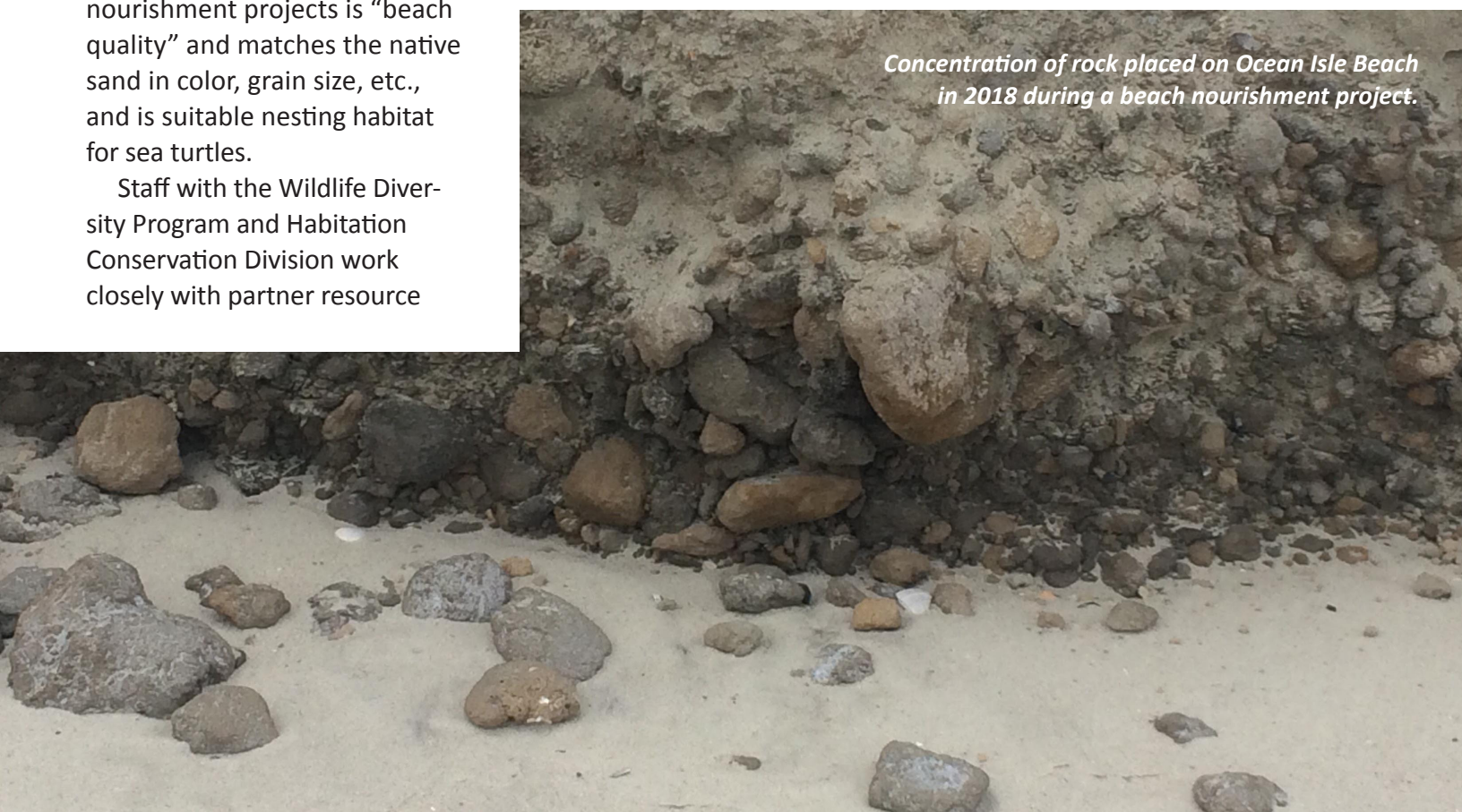
Concentration of rock placed on Ocean Isle Beach in 2018 during a beach nourishment project.

beach would impede the ability of reproductive sea turtles to successfully excavate nest cavities in the sand. Subsequent coordination with the various regulatory agencies and the town resulted in two rock removal efforts to help ensure that this area of the beach could be used by nesting sea turtles. Increased erosion of coastal beaches is anticipated to occur in the future, and in response, more nourishment projects are also likely to occur. Wildlife Diversity Program staff will continue to inspect beach nourishment projects to ensure that suitable sea turtle nesting habitat is maintained on the state's coast.