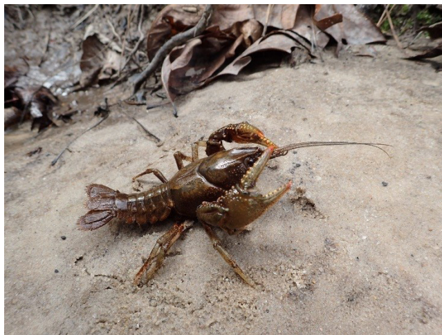
Variable Crayfish