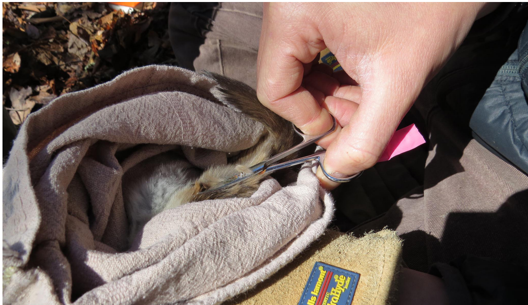
A biologist snips hair from the side of a northern flying squirrel's tail