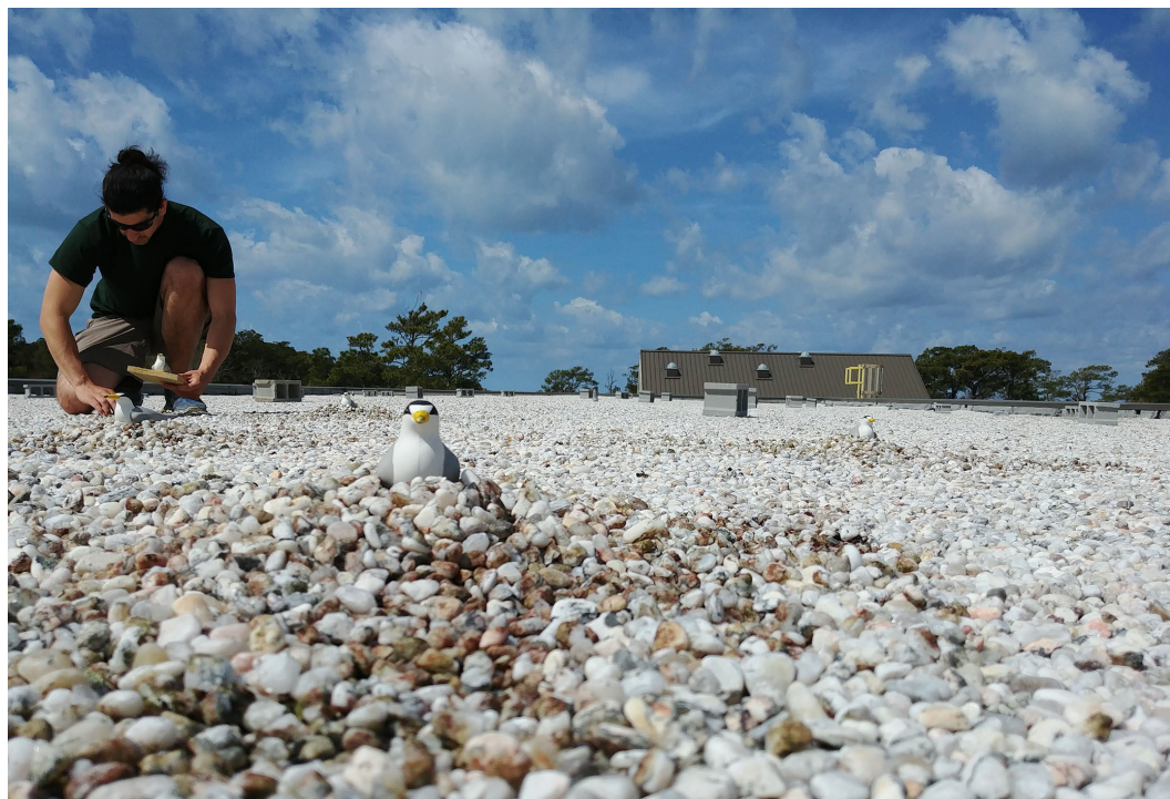
Wildlife Diversity Program technician, Nick Jennings places least tern decoys on the roof of the North Carolina Aquarium at Pine Knoll Shores.