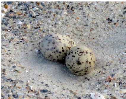
Least tern eggs in the sand

In March, staff from both NCWRC and the aquarium began preparing the tern turret for the upcoming nesting season. They placed least tern decoys on the rooftop to attract nesting birds to the protected breeding grounds of the aquarium roof. They also added 30 concrete blocks to provide cover once the chicks hatch.