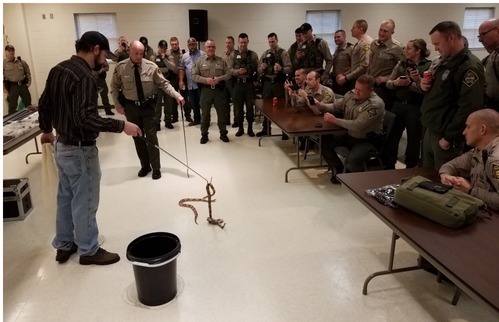
Law Enforcement officers in Districts 6 and 7 learned the appropriate techniques to handling venomous snakes.

Wildlife Diversity Program staff assisted with three training sessions for Wildlife Management and Law Enforcement Divisions on venomous reptiles. In addition, staff conducted a training for D6 and D7 Law Enforcement Officers, specifically focused on conservation of reptiles and amphibians, and those species of particular concern from a poaching and illegal wildlife trafficking perspective. All of these training sessions were well attended with over 50 staff present at each event.