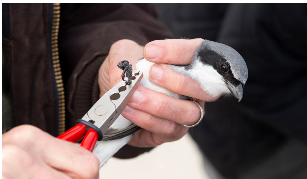
Color banding adult loggerhead shrike near Wilmington.

breeding and wintering populations, genetics, juvenile dispersal, nesting success, and annual survivorship. This effort will help them identify factors that contribute to shrike population declines and their recovery.