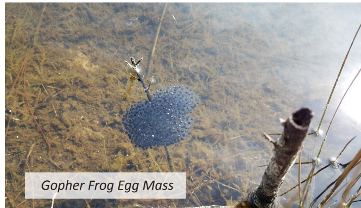
Gopher Frog Egg Mass