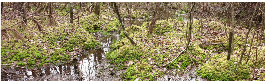
Four-toed salamander nesting habitat