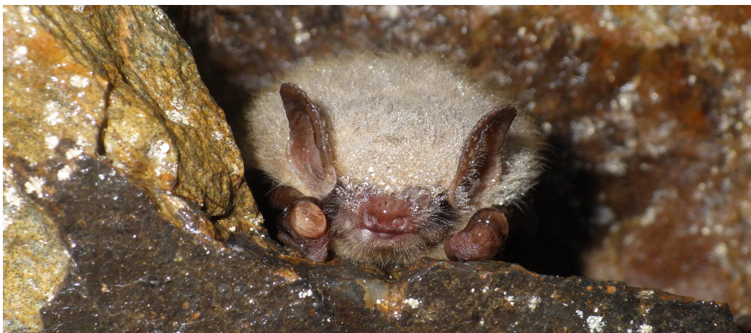
A hibernating tri-colored bat in an inactive gold mine