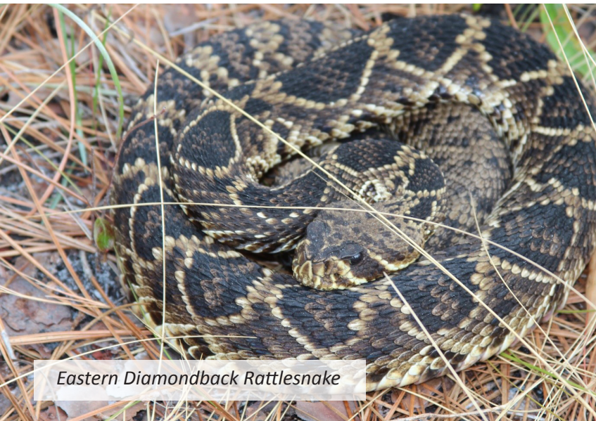
Eastern Diamondback Rattlesnake