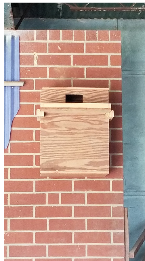
Barn Owl box installed in a disused rendering plant.