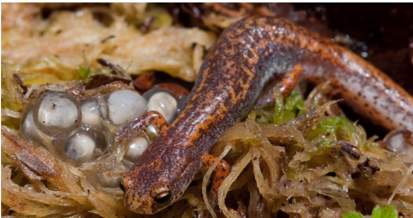
A female four-toed salamander with eggs on nest