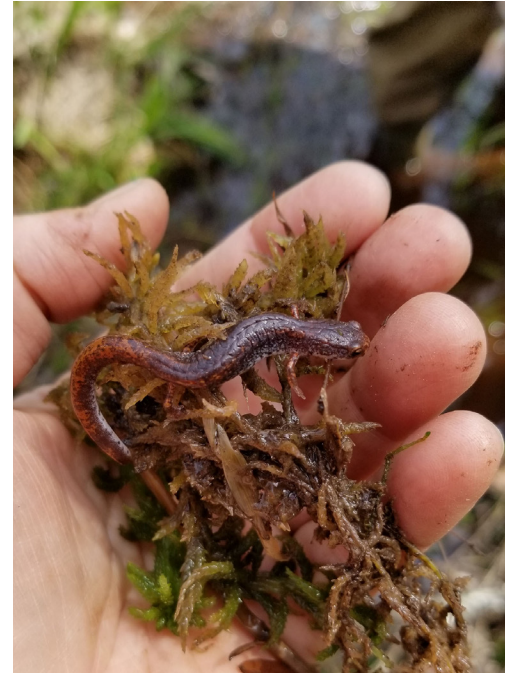
A female four-toed salamander

Pending lab analysis of samples collected will help determine the distribution of the rare “Clade E” four-toed Salamander in the area.