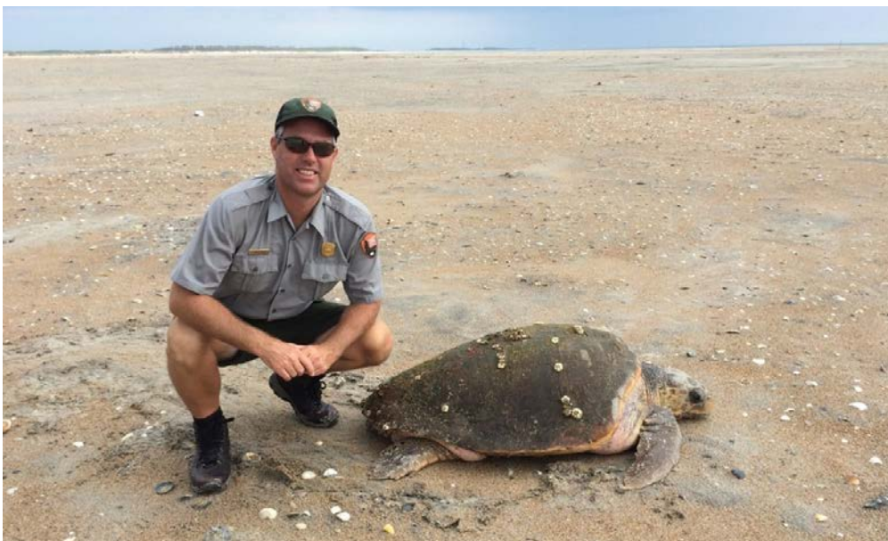
An adult female loggerhead, on Cape Lookout National Seashore, found after she finished nesting but before she successfully found her way back to the ocean in the early morning

nesting outside of the Northern Recovery Unit, but only recently moved to beaches within the area. Historical flipper-tagging data revealed that some adult female loggerheads can switch between nesting beaches as far apart as Cape Lookout National Seashore in North Carolina and Cape Canaveral National Seashore in Florida. It is thought that the Northern Recovery Unit loggerhead population split away from the Florida loggerhead population <20,000 yrs. ago, but there is increasing evidence that low level genetic exchanges across the two regional populations continue to occur.