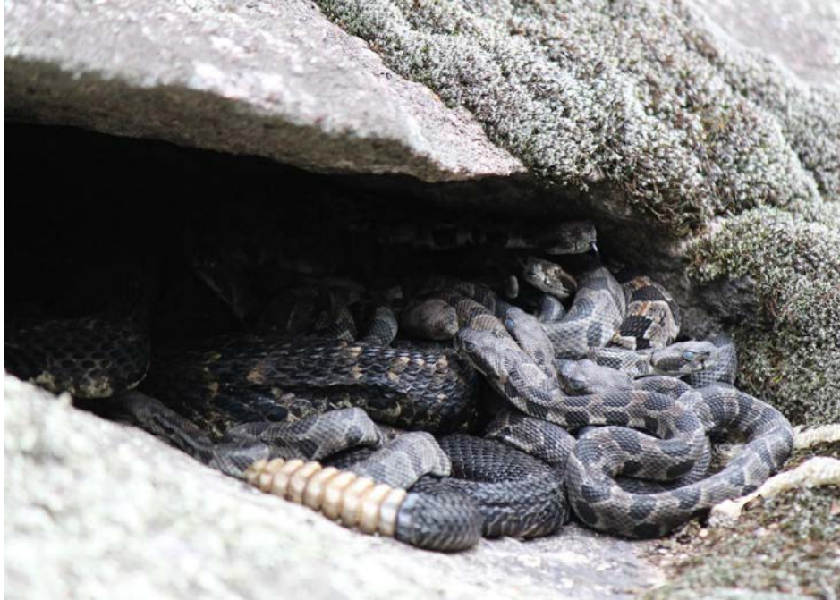
Timber Rattlesnakes in a gestation site with numerous adults and recently born babies (Jeff Hall)

toring of known sites across the state. Records of these species continue to be extremely important to help direct conservation and restoration efforts on the lands that they call home.