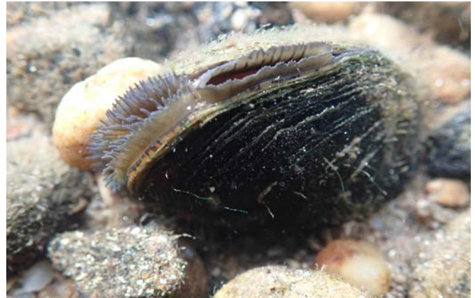
Northern Lance encountered during 2021 survey in the Roanoke bypass channel (Rob Adams)

The significant increase in mussel abundance was attributed to the Northern Lance, Eastern Elliptio and Eastern Lampmussel. These species comprised 97% of all mussels found. Live Roanoke slabshell and Triangle floater were documented in 2021, whereas, in previous surveys, only shells had been collected. Other notable species documented were the Alewife Floater, Tidewater Mucket and Eastern Pondmussel — all listed as state threatened in North Carolina.