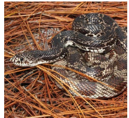
Top photo: Southern hognose snake; Northern pine snake