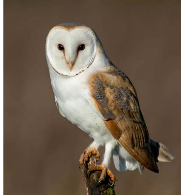
Barn Owl (Trevor Partridge)

In the upcoming quarter, they hope to document any fall nests and install more nest boxes.