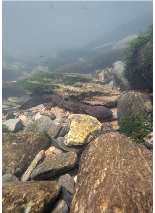
Clockwise from top left: The historic flood in August 2021 ravaged streambanks and deposited deep beds of dry cobble, altering stream flow; During breeding season snorkel surveys in the best Eastern Hellbender populations, it is common to see two or more adults active on the stream bottom; An adult Eastern Hellbender found during breeding season snorkel surveys; Although nesting and breeding activity may have been down from previous years, Wildlife Diversity staff still observed a number of “denmaster” male Eastern Hellbenders guarding their nest rocks.