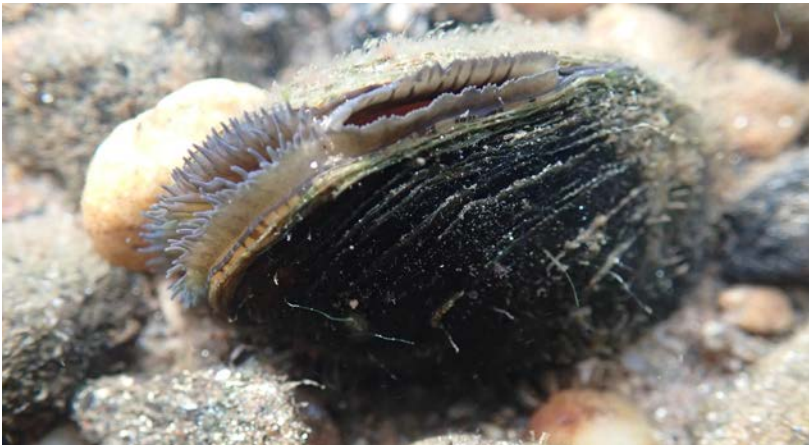
A healthy Appalachian Elktoe found during post-flooding surveys in the West Fork Pigeon River in Haywood County

From the limited number of sites that were searched, biologists were encouraged by what they saw. Although most of the rivers showed signs of bank erosion, riparian damage, and sediment scouring, the majority of sites still had populations of healthy mussels. These populations were typically located in refugia areas, which seemed to be less impacted by the high flows. The major exception was the East Fork Pigeon River, where a previously known small population of mussels could not be accounted for. The long-term impacts of this major flooding event are unknown, but biologists are hopeful that these aquatic ecosystems will quickly rebound.