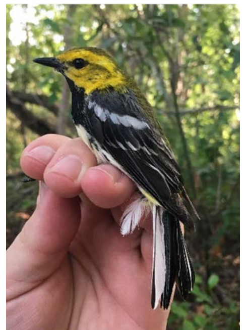
Wayne's Black-throated Green Warbler in Croatan National Forest (J.P. Carpenter)