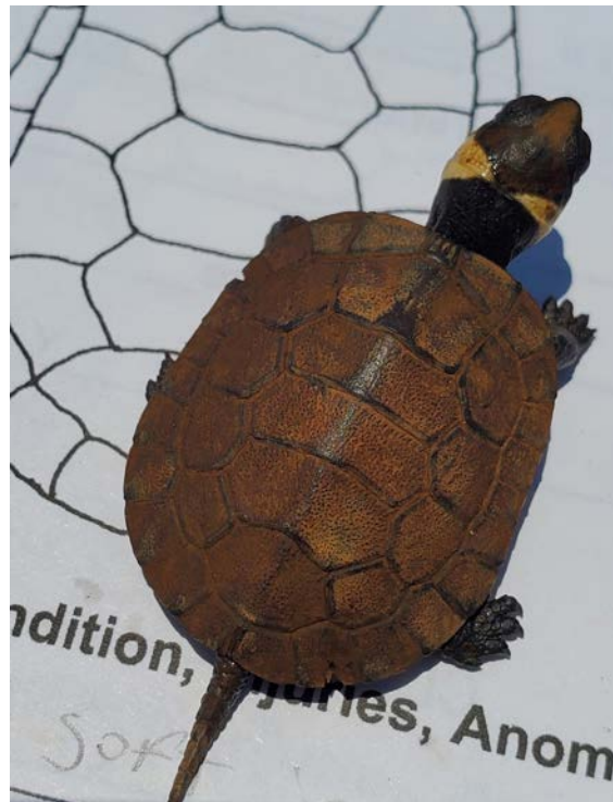
The 9-month old bog turtle that was discovered during surveys at the focal population in summer 2021 (NCWRC)