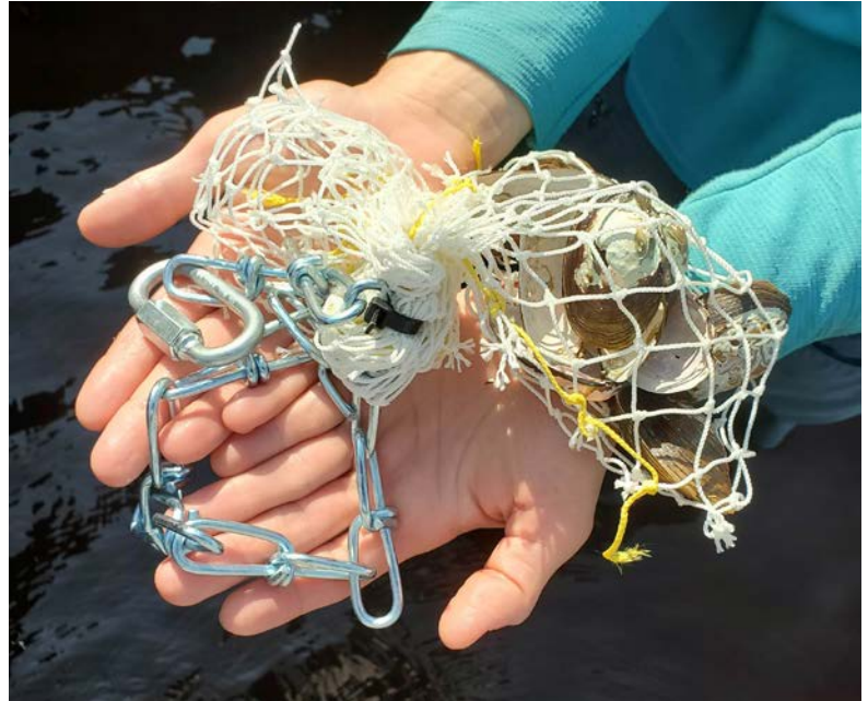
Madtom habitat bag (Brena Jones)

They can be difficult to detect due to their diminutive size (rarely exceeding 65 mm or 2.6 in), so these bags will be checked periodically to determine if fish are using them or if modifications are needed.