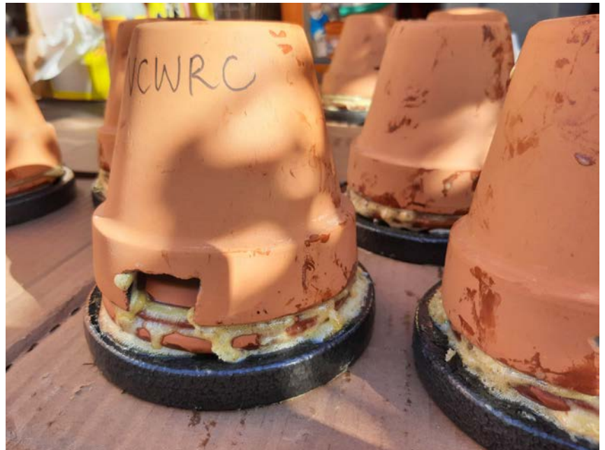
Broadtail Madtoms (Katherine DeVilbiss); An assembled “madtom motel” (Photo NCWRC)