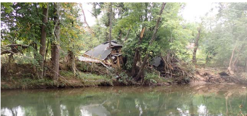
Flooding damage on the East Fork Pigeon River in Haywood County