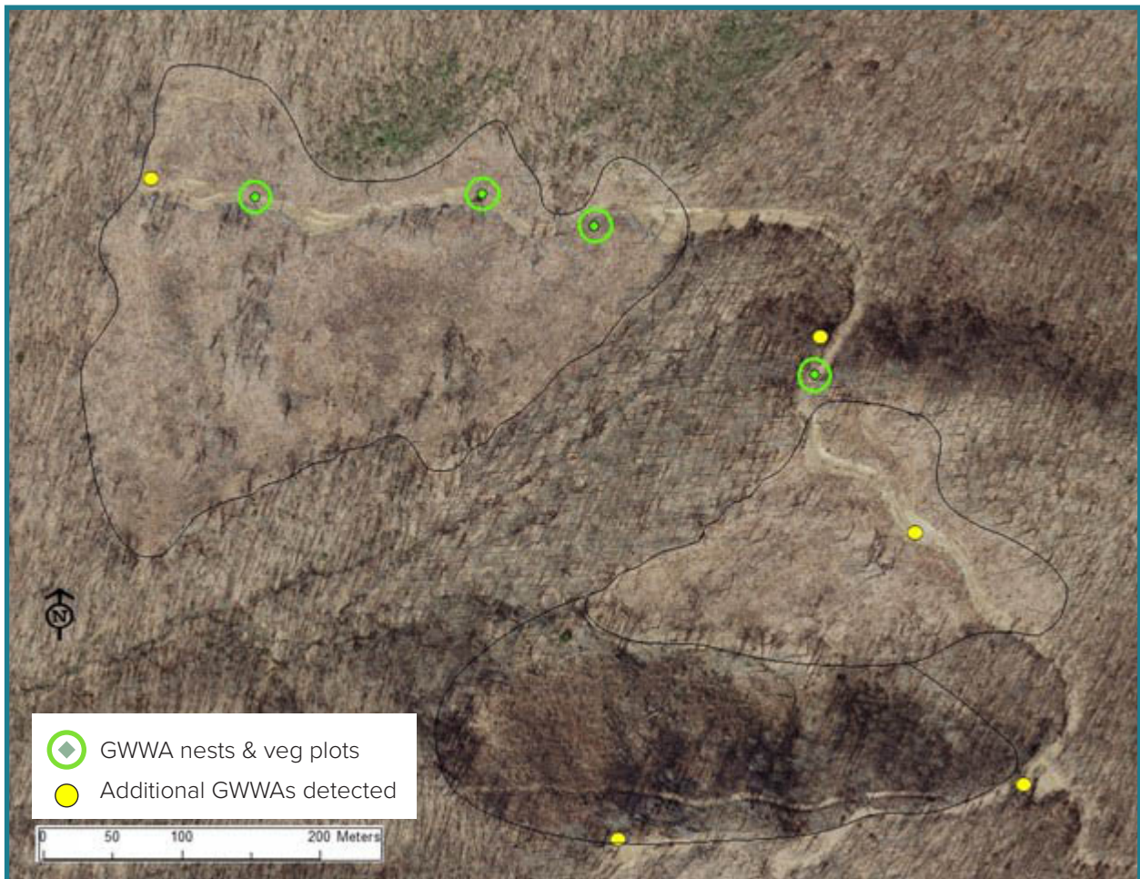
Figure 1. Four of the Golden-winged Warbler nests, vegetation sampling plots at nests, and additional birds detected in the Cheoah Mountains (Graham County), 2021