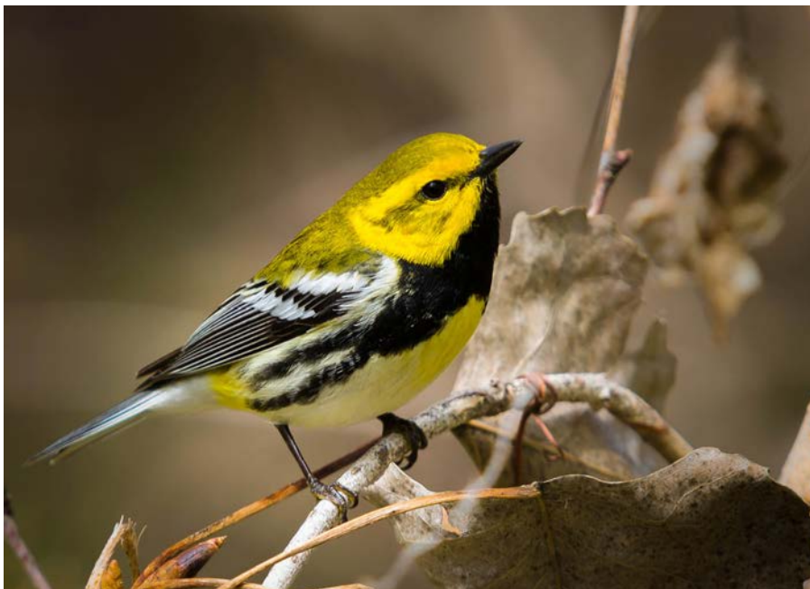
Black-throated Green Warbler

They hope this will help garner Wayne's Warbler, as well as the non-riverine swamp, bay, and pocosin habitats they use, more attention and conservation.