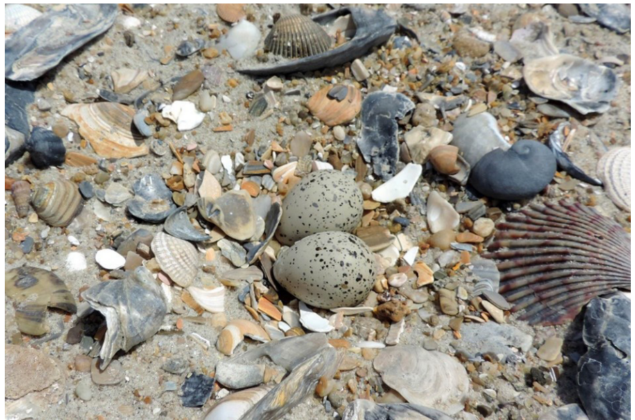
Adult male Piping Plover (top photo); Piping Plover nest with two eggs (Carmen Johnson)