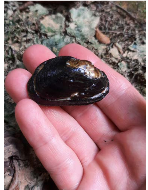
Undescribed mussel species from Little River, Pee Dee basin (Katherine DeVilbiss)

NCWRC staff performed mussel surveys for an unknown, potentially new-to-science species in the Little River and tributary waters of the Pee Dee river drainage to gain valuable geographic range, habitat preference and behavioral information. Since their first discovery in a reach of the Little River in May 2019, individuals of this species were known exclusively from that one locality and one other locality 1.8 km upstream, found in June 2021. In the Little River, 23 surveys were performed, and another 26 in tributary waters including West Fork Little River, Densons Creek, Barnes Creek, Hannahs Creek, and Betty McGees Creek, in Randolph and Montgomery counties. Biologists detected 19 individuals of the unknown species over nine sites, increasing their known range to approximately 6.5 km of the Little River. None were detected during the surveys in other waterways. Search effort totaled 198 person-hours (p-h), for an average catch per unit effort of 0.09 individuals per p-h. Staff swabbed a subset of the found undescribed species for genetic material and took two individuals to the NCWRC Conservation Aquaculture Center in Marion, NC for ongoing life history studies.