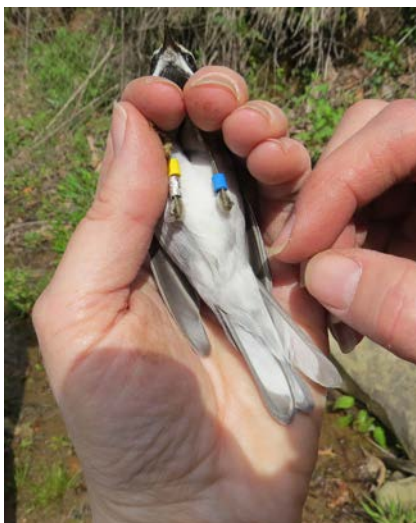
Left photo: In August, NCWRC biologists measured vegetation around the nest of this male Golden-winged Warbler "Dark Blue-silver Yellow" that was banded on May 6, 2021.