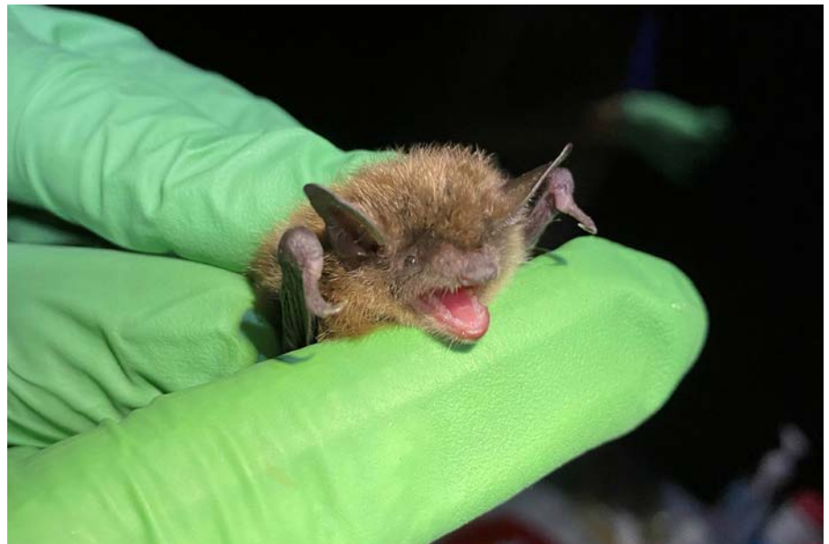
Little Brown Bat captured in Avery County (Kyle Shute)

and began collaboration with Bat Conservation International on a national project dubbed “The Fat Bat Project.” As autumn approached, the NCWRC helped select and set up sites for a pilot study where UV lights are being set up to attract insect prey for bats to feed on before going into hibernation. Recent research has indicated that bats with higher fat stores going into winter are more likely to survive WNS, if infected. As a result, this project was developed with the goal of creating a scalable conservation solution, which could be rolled out across North America to help recover bat populations that have been decimated by WNS.