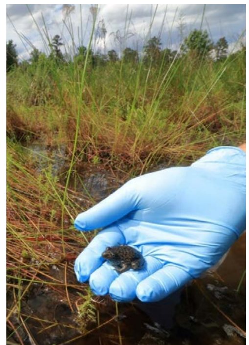
Releasing juvenile Gopher Frogs to a restored wetland in the North Carolina Sandhills (left); A headstarted juvenile Gopher Frog ready for release at a restored wetland