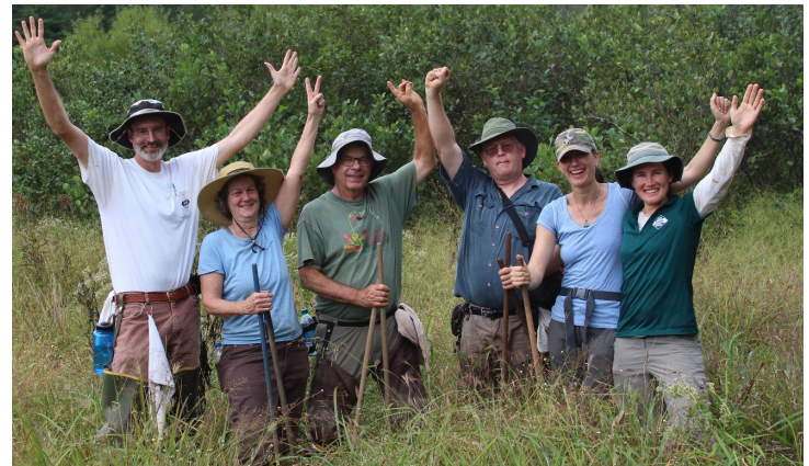
Project Bog Turtle and NCWRC staff excited about a recent bog conservation purchase