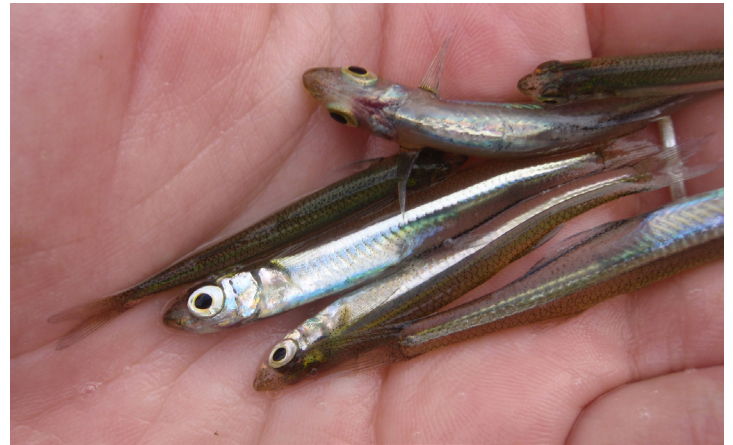
Waccamaw silversides