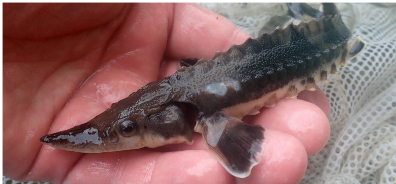
One of ~6,000 lake sturgeon that was stocked in the French Broad River

Due to habitat degradation, barriers to migration and pollution, lake sturgeon have been extirpated from North Carolina and much of the Southeast United States for over 100 years. The Wildlife Commission joined surrounding states in the Southeast Lake Sturgeon Working Group in its comprehensive efforts to restore lake sturgeon to the Tennessee and Cumberland river systems. Brood stock came from the