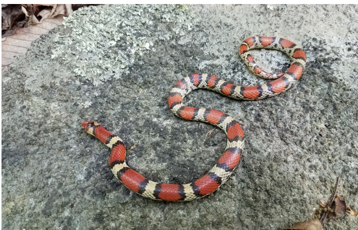
Scarlet snake found on a field trip during the NC Congress of Herpetology