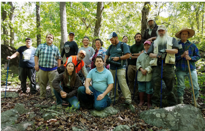
Group field trip during the NC Congress of Herpetology

sources Commission Law Enforcement Division. More than 20 new officers received this training into identification, conservation, regulation and safe handling of reptiles and amphibians.