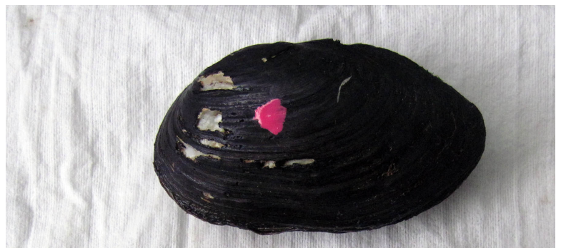
Mussel tagged with paint

tailrace. Repeated high-water events, including Hurricane Florence in September, have altered habitat structure and made sampling conditions more difficult, reducing detection rates. Future monitoring efforts will provide more data about survival, but current results still suggest that translocated animals are persisting.