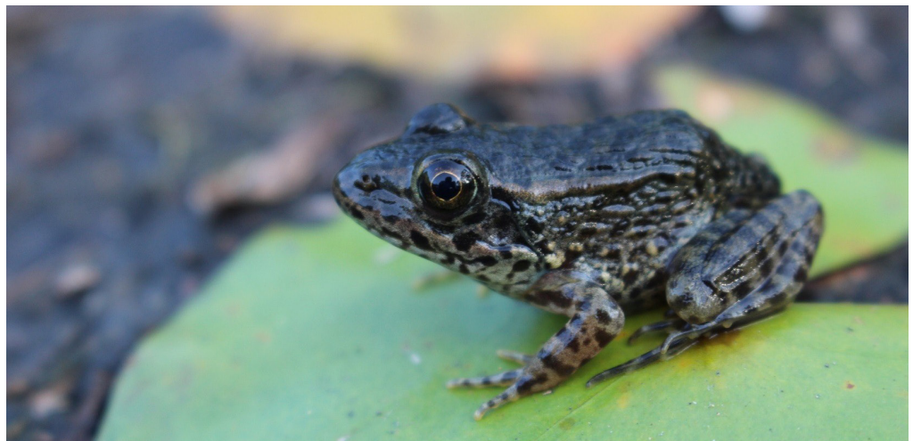
Gopher frog metamorph from previous headstarting effort