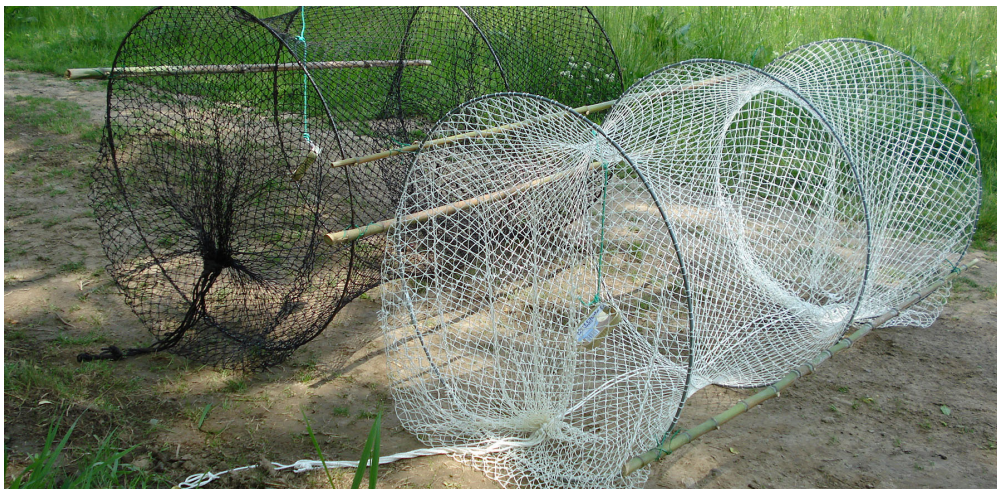
Example of hoop traps used for capturing aquatic turtles

ing the distribution of this priority species in this watershed, but much remains to be done to gain a full picture of the distribution and status of eastern spiny softshell turtles in this watershed and others. Efforts to expand knowledge of this species' distribution and other SGCN aquatic turtle species will continue next year when the weather warms and the turtles are active again. This work will continue in the Hiwassee River Basin and expand into other river basins in western North Carolina.