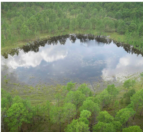
Drone photo of isolated wetland on Sandhills Game Land where gopher frogs bred following Hurricane Florence in September, 2018.

The discovery of gopher frog breeding and numerous egg mass output is encouraging.