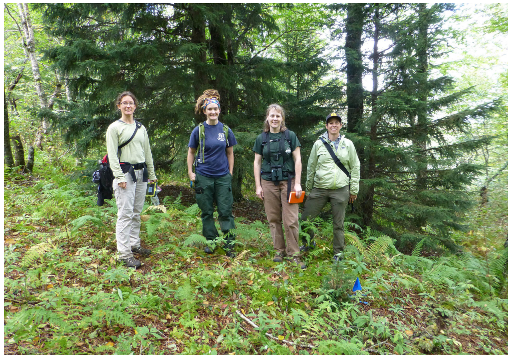
U.S. Forest Service, NWCRC, and Southern Highlands Reserve staff visited the Flat Laurel project area to plan seedling release.