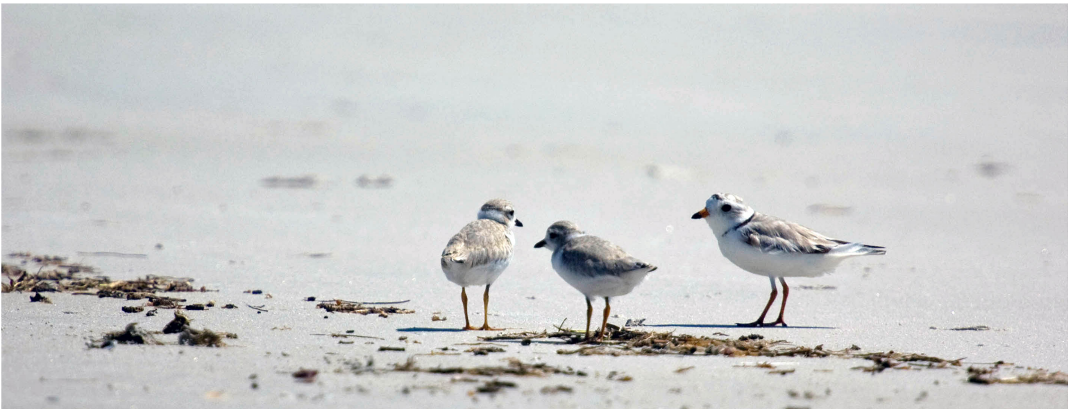
The adult male piping plover stands along the wrack line with two of the four chicks on July 23.

As the chicks aged, staff watched them fly up and down the beach testing their new flight capability. The birds were last observed on July 27 when the chicks were approximately 4 weeks old, likely having left to begin their migration.