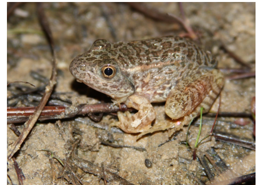
Juvenile gopher frog after release at Holly Shelter game land

game lands. sources Commission Law Enforcement Division. More than 20 new officers received this training into identification, conservation, regulation and safe handling of reptiles and amphibians.