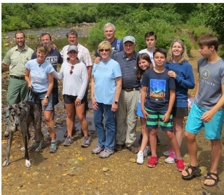
Field trip attendees toured eroded trails in Graveyard Fields and discussed spruce restoration needs in the forested areas west of the fields.