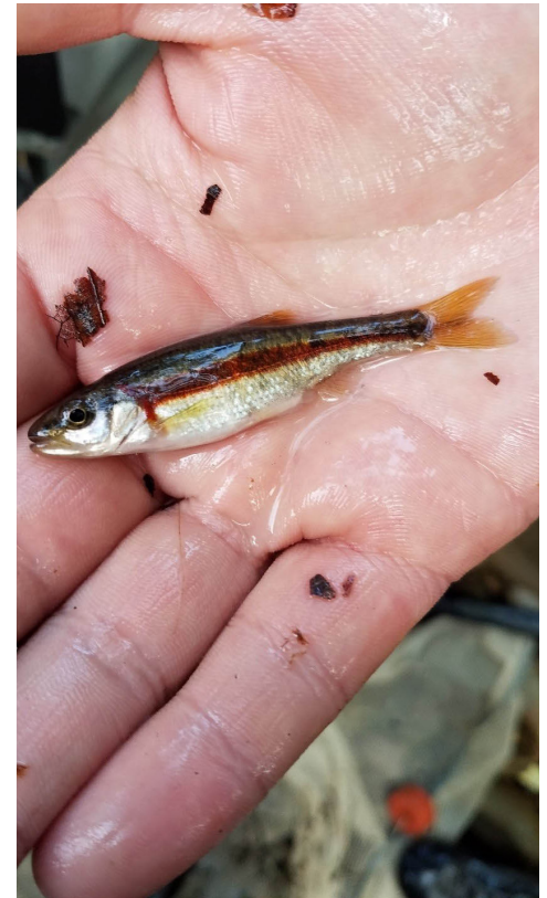
Smoky dace collected in a tributary of the Little Tennessee River