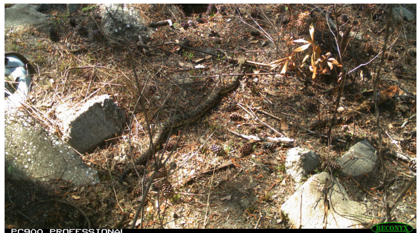
One of two Eastern diamondback rattlesnakes caught on a trail camera on Camp Lejeune

Upland snake surveys this year have included the use of trail cameras for detection. Primarily used on Camp Lejeune, these cameras were extremely helpful in capturing records of Eastern diamondback rattlesnakes. At least four different individuals were depicted on cameras, with a potential of seven snakes captured. This effort will be increased in future years due to this year's success.