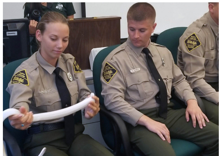
New recruits also familiarize themselves with some non-venomous snakes, such as this albino rat snake