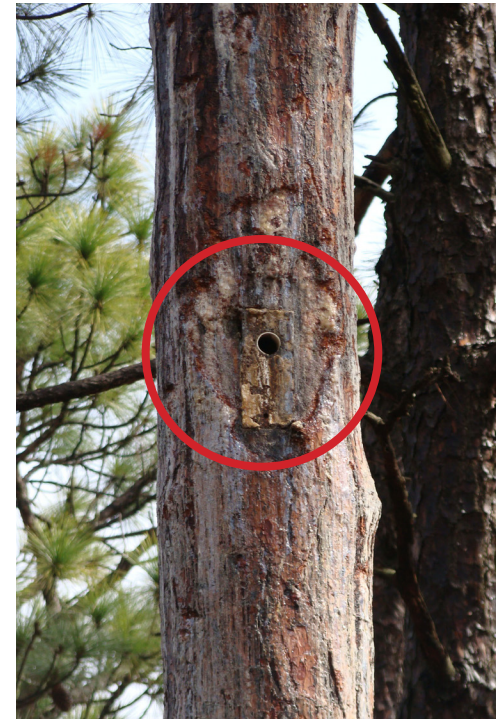
Artificial red-cockaded cavity tree insert

As soon as all information is evaluated, staff will provision new cavities where needed using artificial inserts. This technique is a valuable