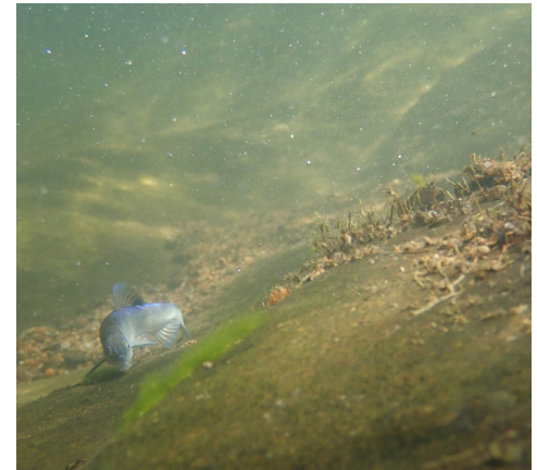
A feeding spotfin chub in the Cheoah River

by mask and snorkels using area defined searches. Three years of data indicate the spotfin chub population occupies the entire Cheoah River below Santeetlah Lake and remains a strong and viable population.