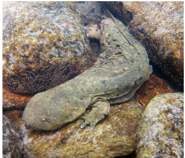
Adult Eastern hellbender active during the breeding season