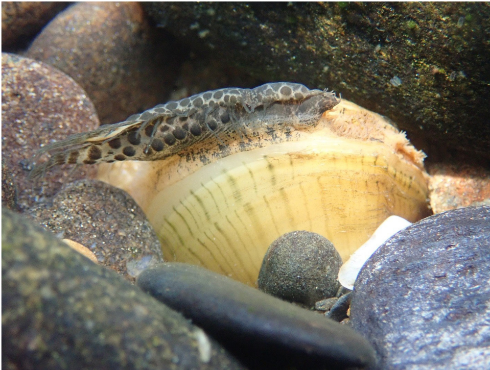
Wavy-rayed lampmussel displaying its lure to attract a host fish in the Cheoah River

Staff surveyed sites targeting priority mollusks in the French Broad and Little Tennessee River basins, primarily by visual snorkeling surveys. Target species included Appalachian elktoe, slippershell, spike, longsolid, wavy-rayed lampmussel, green floater, Tennessee clubshell and creeper.