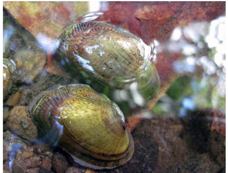
Young brook floaters