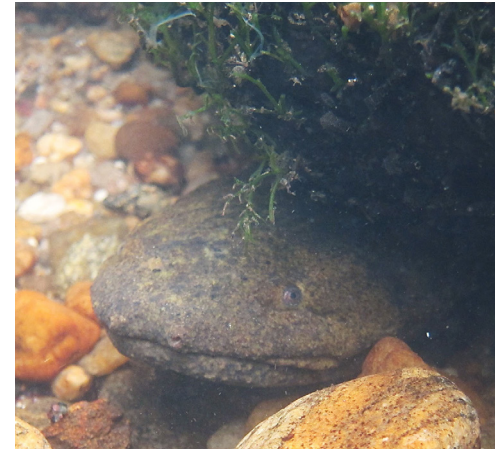
“Denmaster” Eastern hellbender in defensive posture at nest rock.

Staff used underwater cameras to video behaviors and photograph animals, furthering their knowledge of what natural nesting habitats hellbenders select, while making sure not to disturb hellbenders or nest sites. Although it was an intense and condensed window of time, the value of conducting breeding season surveys is well worth staff efforts because of what they can learn, the ease of updating site occurrence records, and the verification of reproductive activity in sites or streams where population status may be currently