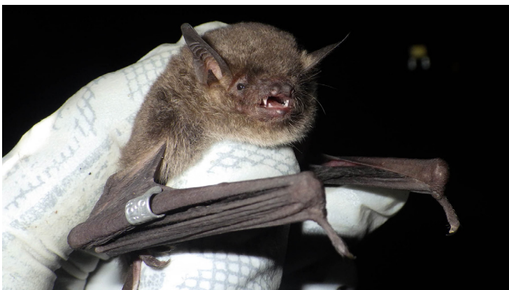
One of 27 gray bats captured during a mistnet survey in Haywood County.

year. This is the only mistnet site where this species is consistently encountered. Little brown bats have been heavily affected by white-nose syndrome and are now very rare in the Mountain Region. Staff applied a radio-transmitter to this bat to better understand the local surviving population of little brown bats, but the bat was never located after release, perhaps due to technical difficulties.