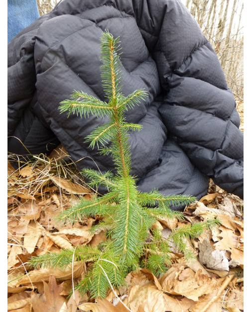
A red spruce seedling

truth the "Current Spruce Units" map developed for SASRI.