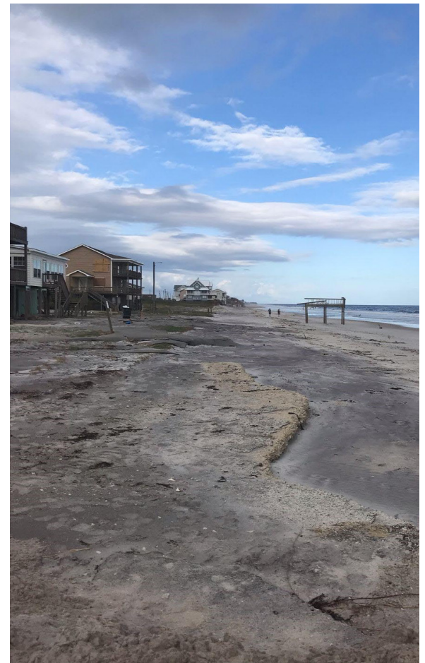
Loss of primary dune in a section of North Topsail Beach, NC, after Hurricane Florence.

and at least five nests in Brunswick, New Hanover and Carteret counties have produced hatchlings after the passage of Florence. The resiliency of some of these impacted eggs and the fact that individual reproductive females produce multiple clutches during a single season show that sea turtles have evolved to withstand the hazards associated with tropical storms and hurricanes that affect the southeast United States coast.