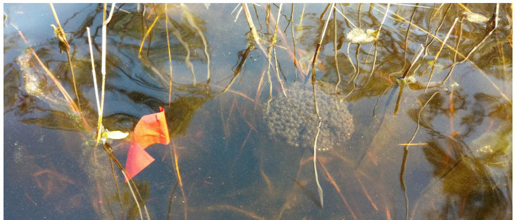
Gopher frog egg mass