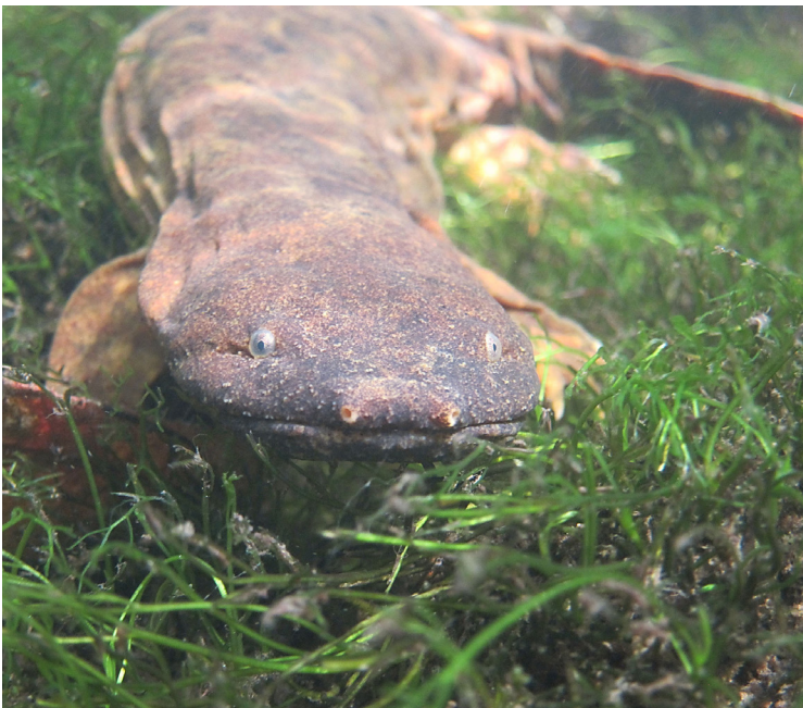
Adult Eastern hellbender active during the breeding season

unknown. Future potential directions for these survey efforts include monitoring nests for success and causes of failure, such as predation, sedimentation or high-water events.