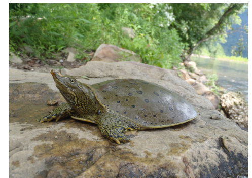
Eastern spiny softshell turtle