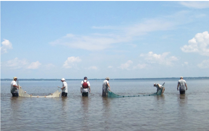
Staff from the Wildlife Commission & NC State Parks seine for SGCN fishes in Lake Waccamaw