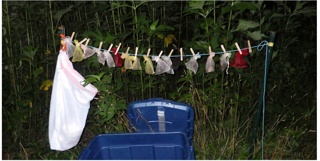
Sixteen big brown bats in holding bags await processing at a mistnet site in Buncombe County.

Another remarkable survey night occurred during a routine long-term survey in Haywood County that typically yields less than 10 bats total, but to the surveyors' surprise, 27 gray bats were caught at once! At another long-term site in Haywood County, a Rafinesque's