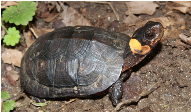
Bog turtle found during surveys/monitoring

Fall Bog Turtle surveys and monitoring are often just as productive as those in the spring, and staff worked in several sites in September. Bog turtles were detected at several sites, including some recaptures.