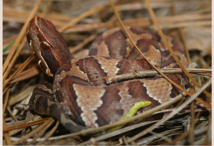
Juvenile cottonmouth. Note the yellow-tipped tail, which is used to attract prey.

Cottonmouths are relatively common occupants of North Carolina's wet-lands, and are often observed basking during the day and foraging at night by human visitors to these ecosystems. Long-term monitoring can alert biologists to potential declines, especially those associated with wetland drainage and degradation due to development of the surrounding upland. Monitoring of wetland snake populations is usually accomplished by setting minnow traps to capture snakes. Because small cottonmouths are ambush predators rather than active foragers, they rarely enter minnow traps, and so their abundance may be underestimated if visual surveys are not used. Actively foraging adult cottonmouths are often too large to fit into trap entrances, which are usually about 1.5 inches in diameter, although occasionally one will try to squeeze its way in to consume a trapped water snake.