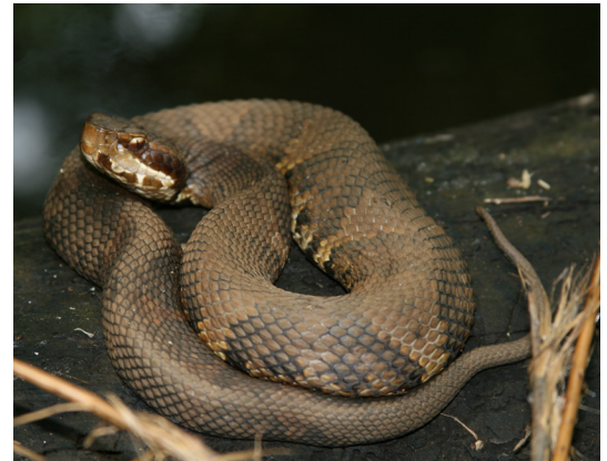
Adult cottonmouth. Note the dark crossbands, which are wider on the sides than on the top. These crossbands often will fade as the snake gets older.