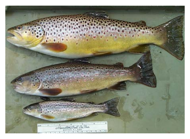
Brown Trout in the Bridgewater Tailrace grow very fast. It only takes a few years for stocked fish to become trophies if they persist. The new regulation will possibly allow more trout to grow to 14 inches and beyond.