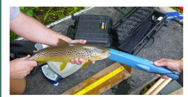
Stocked Brown Trout have a small piece of metal, also known as a "tag," embedded in the cheek. The "tag wand" acts as a metal detector. Using this technique NCWRC biologists can determine if the fish is stocked or wild, how old the fish is, and how fast it is growing.