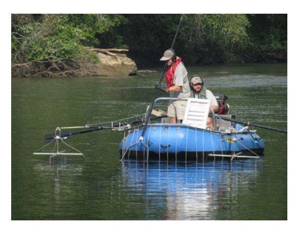
NCWRC biologists use an electrofishing raft to collect Brown Trout from the Bridgewater Tailrace.