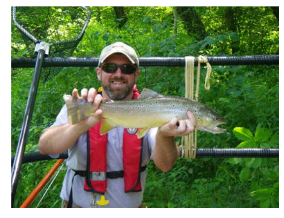
NCWRC biologist holding a nice Brown Trout from the Bridgewater Tailrace.

The NCWRC will continue stocking 10,000 advanced fingerling Brown Trout and evaluating the persistence of these fishes in the Bridgewater Tailrace.