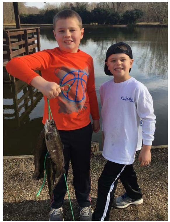
Two young anglers show off their catch from McAlpine Park Lake.