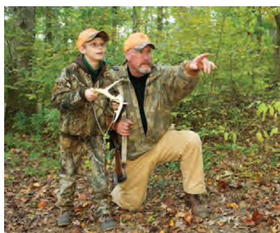
Mentoring makes the difference