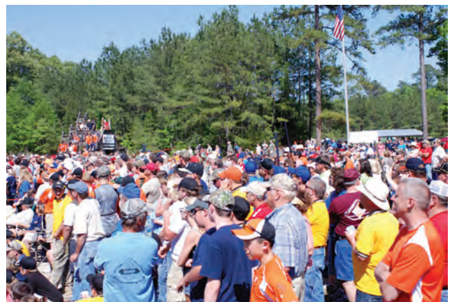
Spectators at the 2011 state tournament

What benefits could be expected for students? This is an opportunity for young people, male and female, to be involved in a team and learn the value of teamwork, sportsmanship and achieving team goals. Several coaches and school administrators have commented to us that many participants have made better grades, improved behavior and increased class attendance once involved in a team. The tournaments also provide an opportunity for participants to be a part of a competitive event. Students who might not typically be involved in athletics can participate in an intense, serious event and be competitive.