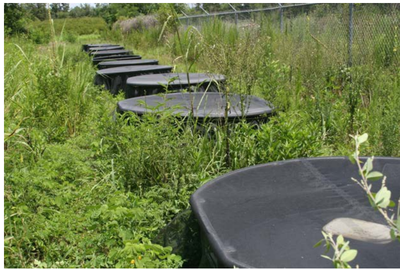
Gopher Frog head-starting tanks

In addition to conducting head-starting and genetic analyses, Commission staff has made significant effort to manage and restore Gopher Frog habitat. Specifically, Commission staff has worked on game lands, as well as on other public lands with external partners to fine-tune the timing and intensity of prescribed fires on the landscape. Summer, late growing-season, hot fires are important to maintaining the landscapes needed for Gopher Frogs. These fires are important for both upland and wetland habitats. Fires later in the year more closely mimic the historical fire regime, when lightning from thunderstorms would have started large fires hundreds of years ago. Fires such as these encourage the growth of herbaceous vegetation in both upland and wetland habitats, as well as creating new stumpholes by burning them out. Additionally, prescribed fire is most effective for these sites if conducted after breeding ponds dry because fire burns across the entire wetland, encouraging herbaceous grasses