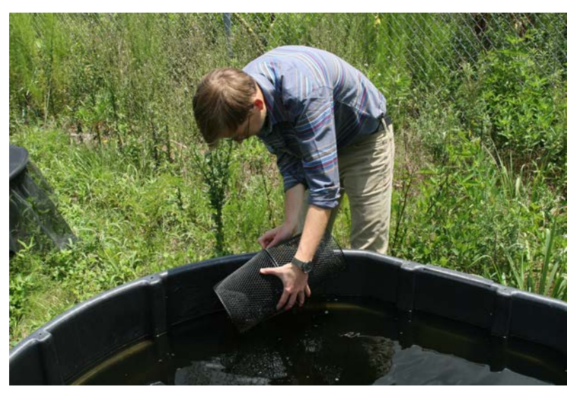
Checking for Gopher Frog metamorphs in minnow trap in head-starting tank

that are critical for egg deposition and tadpole herbivory patterns, as well as reducing organic material build-up and subsequent lowering of pH in the ponds (Roznik and Johnson 2009b). Proper management for Gopher Frogs also benefits other species of conservation concern (e.g., Ornate Chorus Frog, Tiger Salamander, Mabee's Salamander, etc.). Gopher Frog breeding sites routinely support as many as 15-20+ amphibian species, a large number of other vertebrate and invertebrate species, and many rare plants.