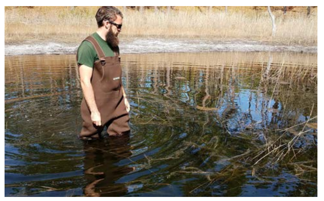
Surveying for Gopher Frogs