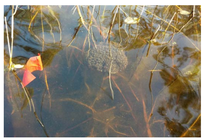
Gopher Frog egg mass