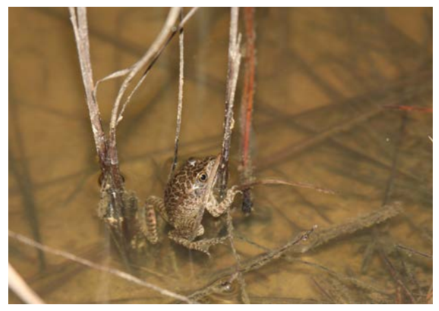
Head-started juvenile Gopher Frog released on to Holly Shelter Game Land