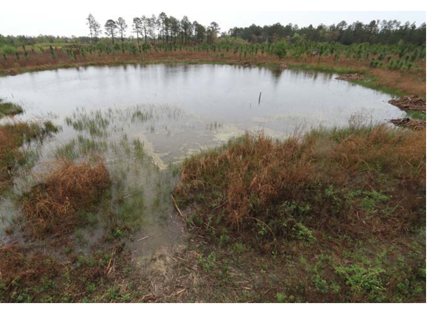
Wildlife Commission staff creating a new pond on the Sandhills Game Land in 2013 (top photo); the same pond in 2019

Commission staff and partners have also made great strides in wetland restoration and creation. Gopher Frogs prefer open canopy, herbaceous wetlands. In sites that have experienced infrequent fires or fires outside the late growing season, wetland shrub and tree canopies often develop. Commission staff on Sandhills Game Land and Holly Shelter Game Land, as well as DoD staff on MOTSU, and USFS staff on Croatan, have all worked toward opening the canopies of wetlands by harvesting trees, and in some cases, removing heavy duff layers in unburned wetlands. Commission staff on Sandhills Game Land also created a new pond in October 2013, specifically targeting use by the Gopher Frog. As of 2018, Gopher Frogs have bred in this artificially constructed wetland in at least two separate years.