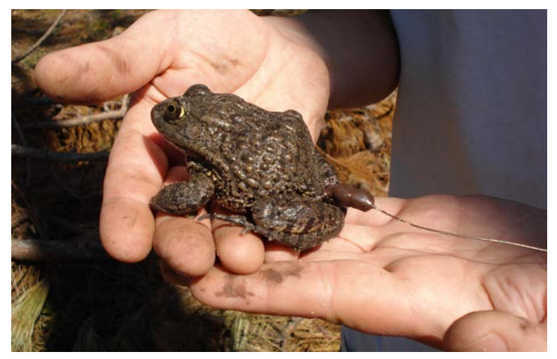
Gopher Frog with transmitter