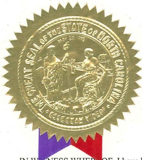
BEVERLY EAVES PERDUE

NOW, THEREFORE, I, BEVERLY EAVES PERDUE, Governor of the State of North Carolina, do hereby proclaim May 19-25, 2012, as "SAFE BOATING WEEK" in North Carolina, and urge citizens to be responsible boaters.