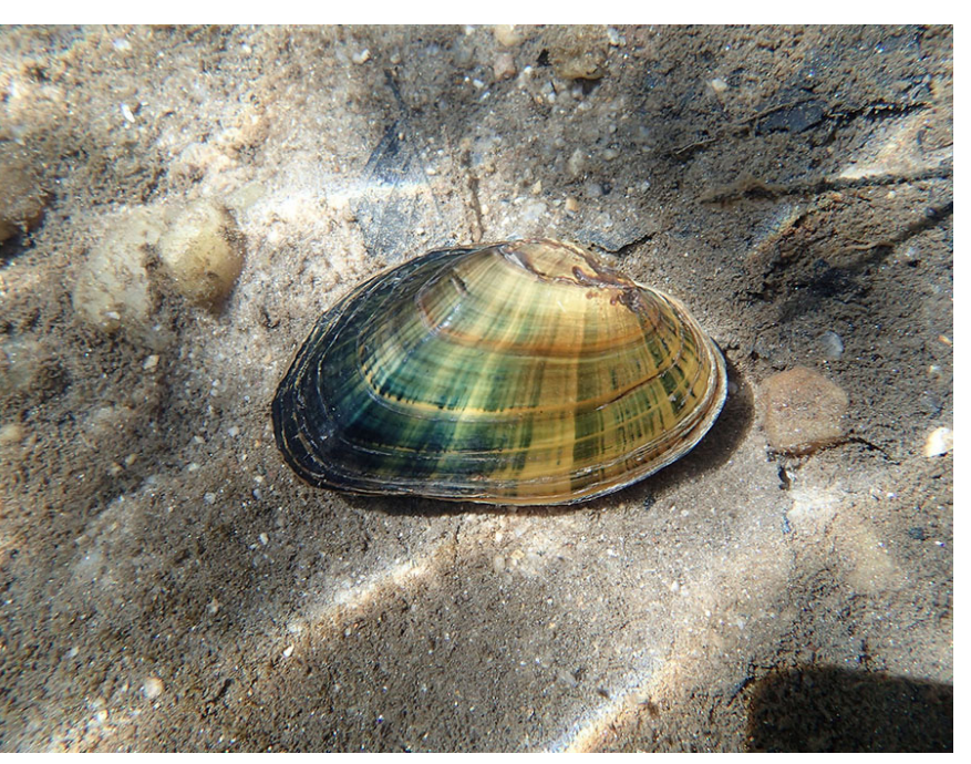
Wildlife Commission biologists are working to ensure the long-term viability of the Brook Floater.