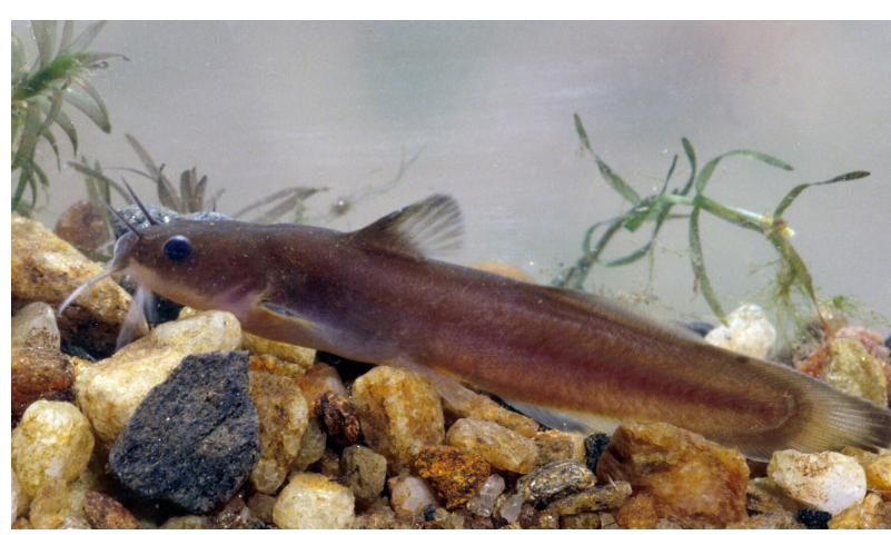
Researchers recently completed a host fish study for Brook Floater and found Margined Madtoms to be the most suitable host in North Carolina.

to support ongoing efforts to conserve Brook Floaters via translocation and augmentation of extirpated populations such as the Catawba River downstream of Lake James, Upper South Fork Catawba River (Henry and Jacob Forks), and the Upper Yadkin River upstream of Kerr Scott Reservoir. Other recent efforts have focused on limiting vehicular traffic in streams occupied by Brook Floaters, biological assistance focusing on new HQW/ORW water quality classification in occupied rivers such as the Roaring River, technical guidance to land-protection organizations purchasing tracts of land adjacent to occupied streams, and initiation of a mark-recapture study in core populations in order to track temporal changes.