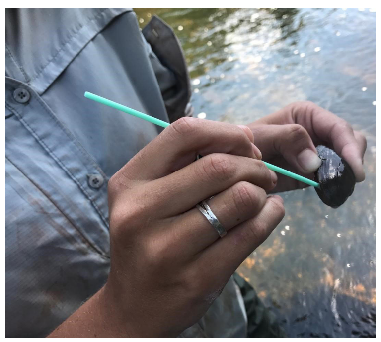
Collecting tissue from a brook floater for genetic analysis