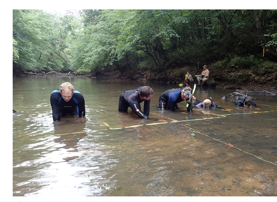
Conducting mussel surveys

in the upper Johns River basin with CPUEs ranging