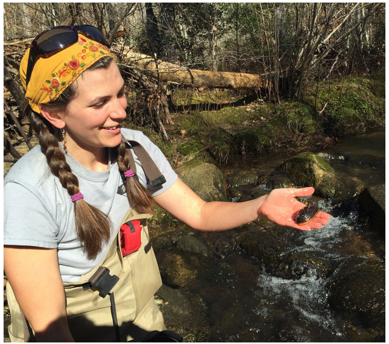
Brook Floater found in the Linville River