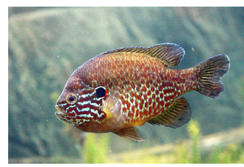
To complete its life cycle, the Brook Floater requires a fish host, such as this Pumpkinseed Sunfish.

The Brook Floater is typically found in well oxygenated free-flowing rivers and streams in gravel riffles along the Blue Ridge Escarpment and into the upper Piedmont. It is predominantly a filter feeder consuming bacteria, algae, and plant and animal debris. Like almost all mussels, the Brook Floater requires a fish host to complete its life cycle. Identified fish hosts for the Brook Floater include: Blacknose Dace, Longnose Dace, Golden Shiner, Pumpkinseed, Slimy Sculpin, Yellow Perch, and Margined Madtom (Bogan 2002; Nedeau et al 2000; <a href="https://www.ncwildlife.org/Learning/Species/Mollusks/Brook-Floater#3029857-life-history">https://www.ncwildlife.org/Learning/Species/Mollusks/Brook-Floater#3029857-life-history</a>). The species typically releases glochidia in February-April in North Carolina.