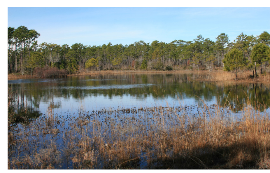
Gopher Frogs usually breed in isolated, fish-free, ephemeral wetlands

The Gopher Frog is associated with the Longleaf Pine ecosystem in the southeastern United States. This ecosystem is considered critically endangered, having been reduced by more than 98% (Noss et al. 1995). The Gopher Frog requires both appropriate breeding ponds and upland terrestrial habitat. Breeding ponds must be large enough to retain water throughout the tadpole stage, but shallow enough to dry periodically, because the Gopher Frog does not tolerate fish. Additionally, these ponds must be relatively open-canopy and have a heavy herbaceous component. Gopher Frogs deposit their egg masses on the stems of herbaceous