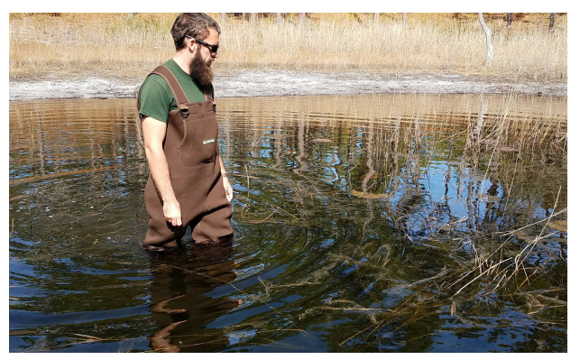
Surveying for Gopher Frogs