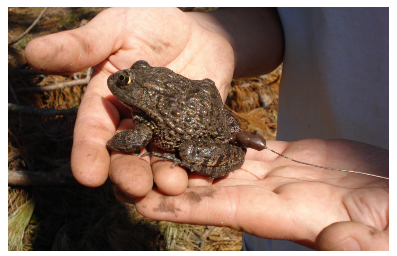
Gopher Frog with transmitter