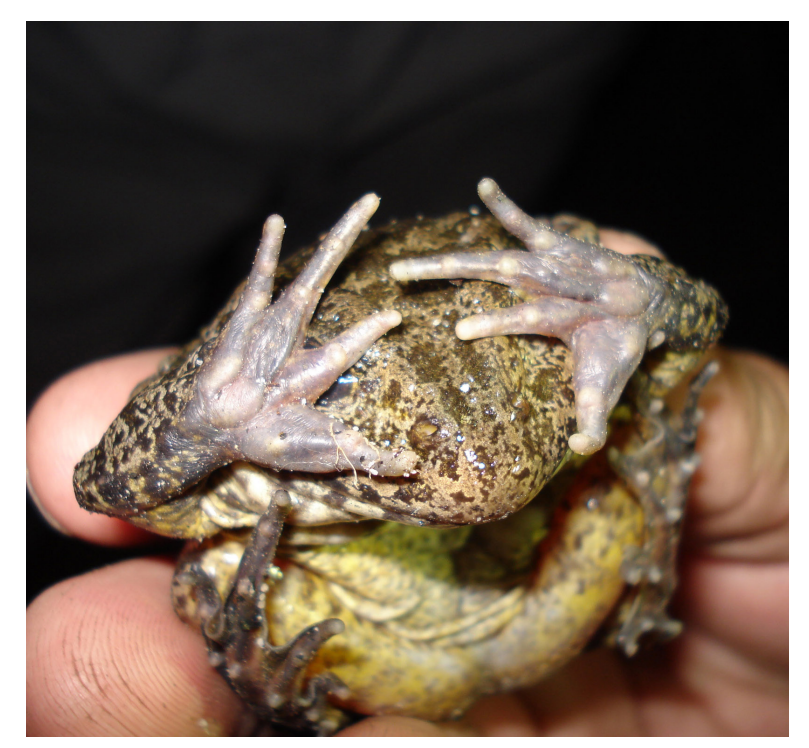
Gopher Frog in a "defensive" posture (Jeff Humphries)