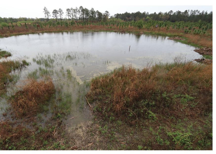
Wildlife Commission staff creating a new pond on the Sandhills Game Land in 2013 (top photo); the same pond in 2019 (Bottom photo: Mike Martin)

Commission staff and partners have also made great strides in wetland restoration and creation. Gopher Frogs prefer open canopy, herbaceous wetlands. In sites that have experienced infrequent fires or fires outside the late growing season, wetland shrub and tree canopies often develop. Commission staff on Sandhills Game Land and Holly Shelter Game Land, as well as DoD staff on MOTSU, and USFS staff on Croatan, have all worked toward opening the canopies of wetlands by harvesting trees, and in some cases, removing heavy duff layers in unburned wetlands. Commission staff on Sandhills Game Land also created a new pond in October 2013, specifically targeting use by the Gopher Frog. As of 2018, Gopher Frogs have bred in this artificially constructed wetland in at least two separate years.