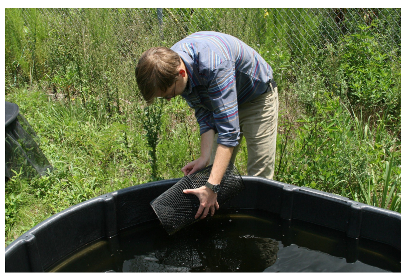
Checking for Gopher Frog metamorphs in minnow trap in head-starting tank

that are critical for egg deposition and tadpole herbivory patterns, as well as reducing organic material build-up and subsequent lowering of pH in the ponds (Roznik and Johnson 2009b). Proper management for Gopher Frogs also benefits other species of conservation concern (e.g., Ornate Chorus Frog, Tiger Salamander, Mabee's Salamander, etc.). Gopher Frog breeding sites routinely support as many as 15-20+ amphibian species, a large number of other vertebrate and invertebrate species, and many rare plants.