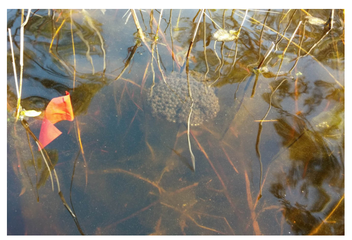
Gopher Frog egg mass