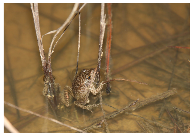
Head-started juvenile Gopher Frog released on to Holly Shelter Game Land