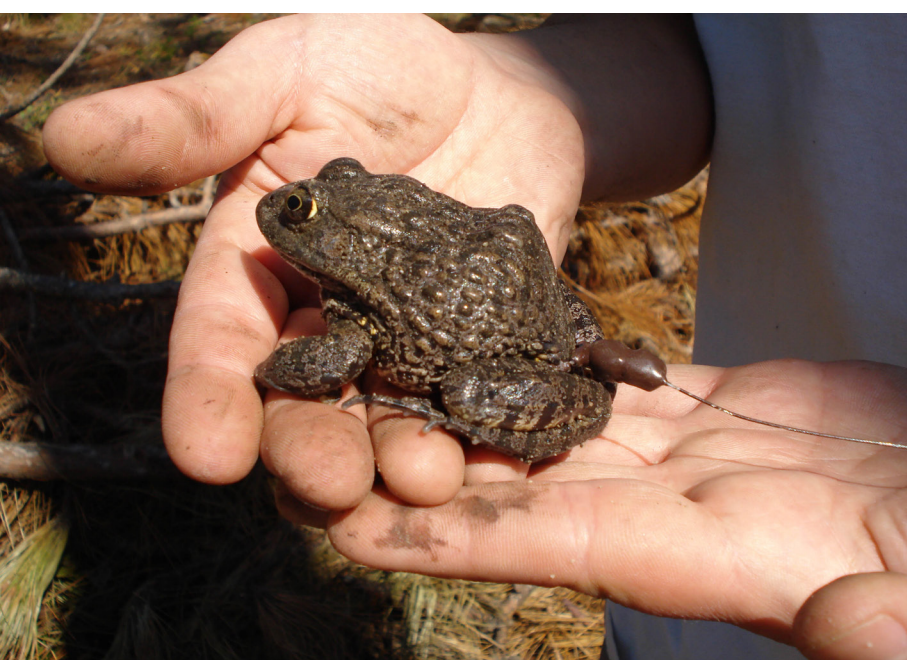
Gopher Frog with a transmitter for tracking purposes

The Commission will encourage private landowners with Gopher Frog habitat on their property to participate in the Wildlife Conservation Land Program. This program allows qualifying landowners whose property contains state listed species to get a break in property taxes for implementing conservation actions.