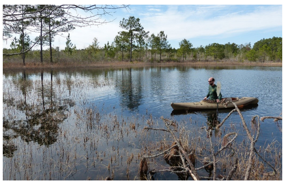
Staff surveying for gopher frogs on the Sandhills Game Land

Take or possession of this species without a valid permit is currently prohibited under NC law and administrative code (15A NCAC 10I .0102) and is considered a Class 1 misdemeanor (§ 113 337b). It is unlawful to release hatchery-raised fish on game lands without prior written authorization (15A NCAC 10D .0102), which could help prevent introduction of fish into ponds used by Gopher Frogs. Additionally, Commission regulations (15A NCAC 10B .0123) prohibit import, transport, export, purchase, possession, sale, transfer, or release into public or private waters or lands of the State, any live specimen(s) of Tongueless or African Clawed Frog ( Xenopus spp.; known carriers of the chytrid fungus Bd ), and several genera of Asian newts ( Cynops, Pachytriton, Paramesotriton, Laotriton, Tylototriton; all known carriers of the chytrid fungus Bsal ).