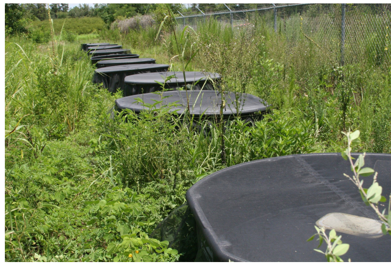
Gopher Frog head-starting tanks

In addition to conducting head-starting and genetic analyses, Commission staff has made significant effort to manage and restore Gopher Frog habitat. Specifically, Commission staff has worked on game lands, as well as on other public lands with external partners to fine-tune the timing and intensity of prescribed fires on the landscape. Summer, late growing-season, hot fires are important to maintaining the landscapes needed for Gopher Frogs. These fires are important for both upland and wetland habitats. Fires later in the year more closely mimic the historical fire regime, when lightning from thunderstorms would have started large fires hundreds of years ago. Fires such as these encourage the growth of herbaceous vegetation in both upland and wetland habitats, as well as creating new stumpholes by burning them out. Additionally, prescribed fire is most effective for these sites if conducted after breeding ponds dry because fire burns across the entire wetland, encouraging herbaceous grasses