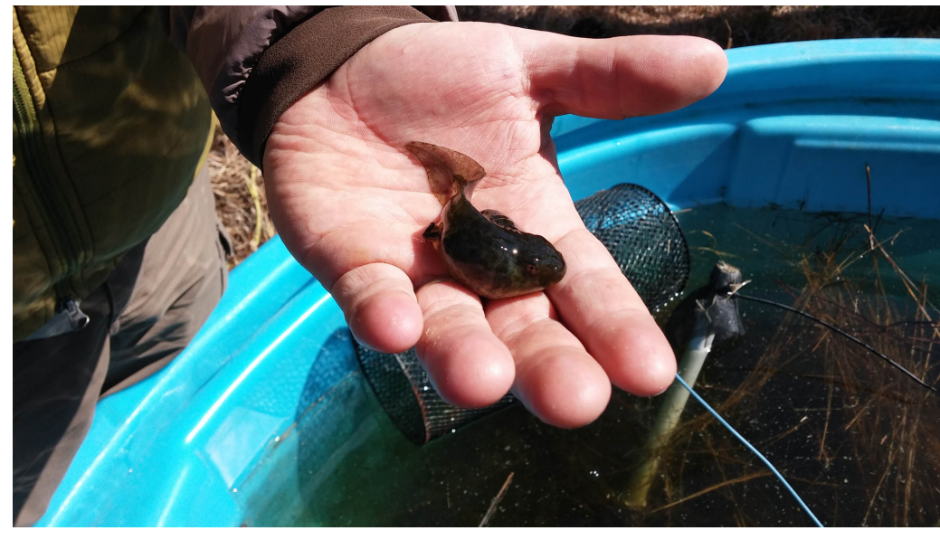
Gopher Frog tadpole

breeding sites. Research in North Carolina corroborates long-distance travel to breeding sites, with telemetered animals traveling an average of 1.3 km away from a Sandhills breeding site, and a maximum of 3.5 km (Humphries and Sisson 2012). In addition, during a separate project, a Gopher Frog from this same Sandhills breeding site was detected by drift fence, 5.2 km away. Thus, this species requires large tracts (typically >5,000 acres) of fire-maintained upland Longleaf Pine forest with embedded isolated ephemeral wetlands.