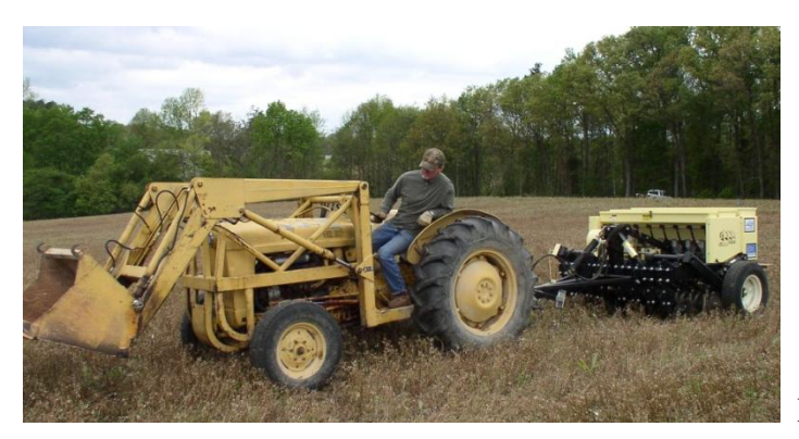
Native Warm Season Grass Establishment

Typical practices which improve wildlife habitat that can be funded by EQIP include: