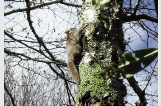
A gliding tree squirrel

The northern flying squirrel inhabits the cool, wet boreal and deciduous forests of North Carolina's highest mountains. It prefers a mix of conifers (red spruce, Fraser fir, Eastern hemlock) and northern hardwood trees (yellow birch, buckeye, sugar maple). Biologists have found that the squirrel forages in the conifers and dens in the hardwoods. Dens are found in live and dead trees and include old woodpecker cavities, rotted knotholes where branches have broken off,