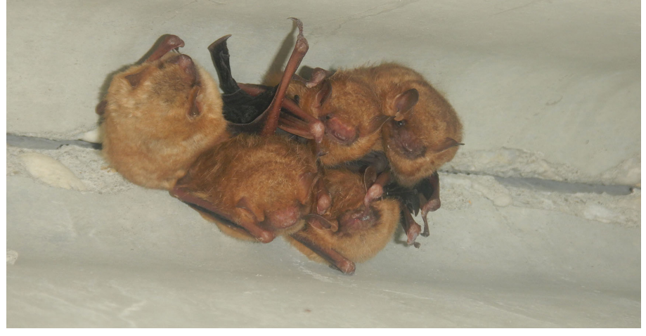
A cluster of tricolored bats roosting under a Coastal Plain bridge (Katherine Etchison)

Because the historic dataset is proving useful in finding current bat roosts, additional follow-up bridge roost surveys are planned for the coming years.