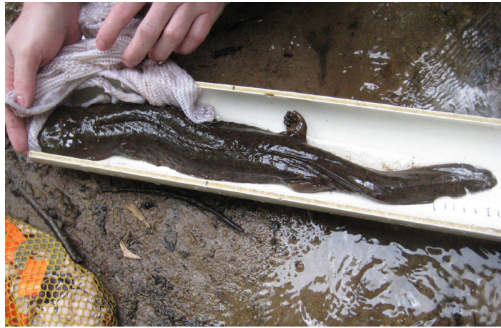
An adult Eastern Hellbender in a measuring board for data collection (Doug Hall)