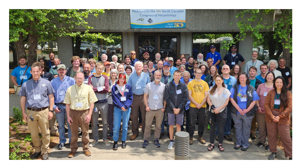
Attendees gather for a photo during the NCPARC and NCHS joint meeting in May in Asheboro