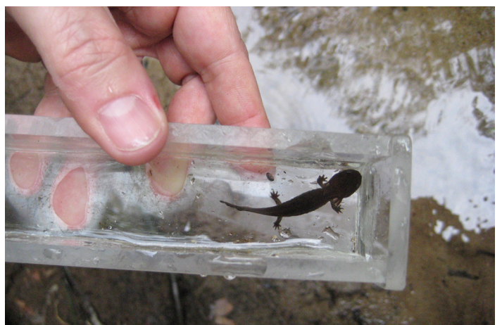
One of many Eastern Hellbender gilled larvae (1 year-old) found in the upper Watauga River drainage. (Doug Hall)