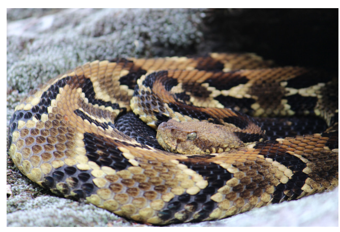
Timber Rattlesnake (Jeff Hall)

Continuing a long-term genetics project focused on conservation of the Timber Rattlesnake, NCWRC staff made several visits to known rattlesnake sites. During these visits, tissue samples in the form of shed skins are acquired for future analysis to supplement clipped scales and/or muscle tissues taken from road-killed specimens. Additionally, NCWRC staff continued receiving rattlesnake reports from the public with well over 200 sightings reported to date in 2023. These sightings are used to document important habitats for rattlesnakes.