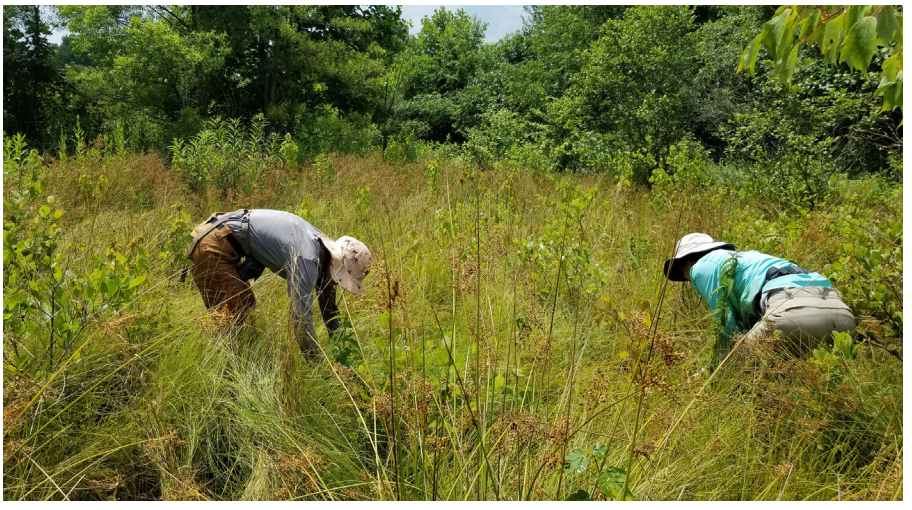
Figure 2. Biologists searching for bog turtle nests in a wetland in summer 2023 (Gabrielle Graeter)