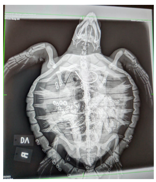
A radiograph of a Kemp's ridley sea turtle that swallowed a recreational fishing hook at a fishing pier. The turtle was taken to the NC Aquarium on Roanoke Island for hook removal.