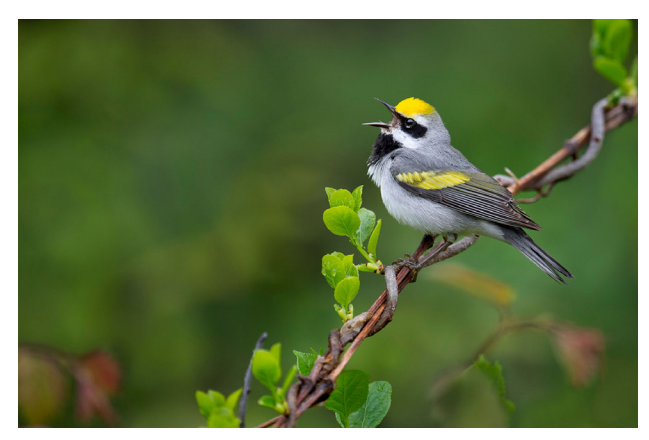
Golden-winged Warbler (Ray Hennessey)

Resight surveys kicked off in late April 2023 just as the birds were returning from South America. Biologists completed extensive resight surveys, searching for returning individuals with the aid of visual searches, audiolures, and of course a radio-receiver and Yagi antenna to detect nanotag signals. Although the number of golden-winged warblers on territory in the area was similar to recent years, most individuals were unbanded. Overall, the team found five returning birds, two of which were from the 2022 cohort and the other three from earlier cohorts (two from 2021 and one from 2018). One of the two returning individuals from the survival study was a color-banded control bird, a male. The other was a nanotagged female. These numbers are disappointing, but before jumping to conclusions, NCWRC biologists await the University of Maine's analysis of the full rangewide dataset. The survival data are just one piece of a comprehensive Integrated Population Model that partners hope will highlight the critical factors limiting Appalachian golden-wing populations.