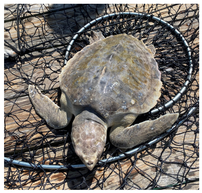
A Kemp's ridley sea turtle that was incidentally captured by a hook-and-line recreational angler on a fishing pier. The turtle was raised to the deck of the pier with a hook net to facilitate hook removal, after which the turtle was released. (NC Aquariums)

Overall, the number of reported hook and line interactions has been increasing in the past five years, with 52 reported hook-and-line interactions so far in 2023. Although it is likely that the actual number of sea turtle interactions with recreational anglers is underreported, increasing the overall rate of reporting will help increase our understanding of these interactions and illuminate possible management actions to minimize risk to sea turtles.