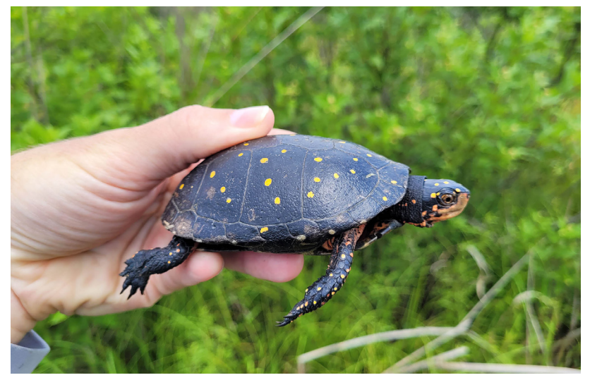
Spotted Turtle (Jeff Hall)