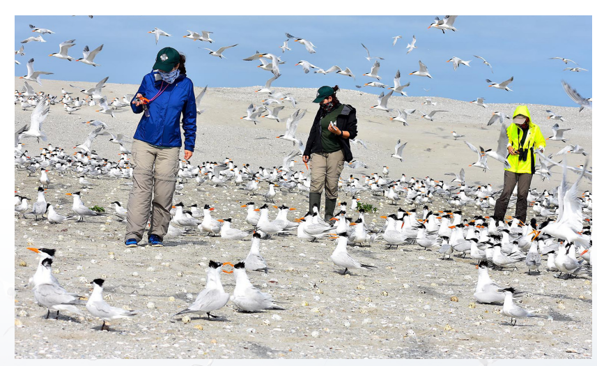
Staff carefully walk through a Royal and Sandwich Tern colony counting nests. Below: Approximately 8,000 Royal and Sandwich Tern nests were counted in this colony on a dredge material island in Pamlico Sound.

Waterbird database maintained by the NCWRC. For the first time, data will also be entered into the Avian Knowledge Network as part of an effort by states and provinces in the Atlantic Flyway to share data and assess wider population and distribution trends. A report will be completed later this year and will be used to guide management decisions in the state.