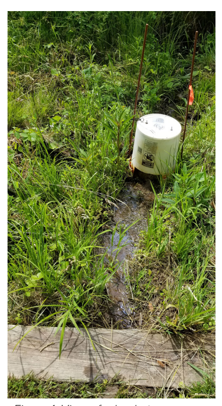
Figure 1. View of a bucket-camera trap set in a rivulet within a mountain bog

In the last few months, NCWRC staff have also been involved in collecting genetic tissue swab samples from bog turtles in North Carolina, taking action to manage habitat with non-native invasive species, and surveying for and protecting bog turtle nests to improve nest hatching success (Figure 2).