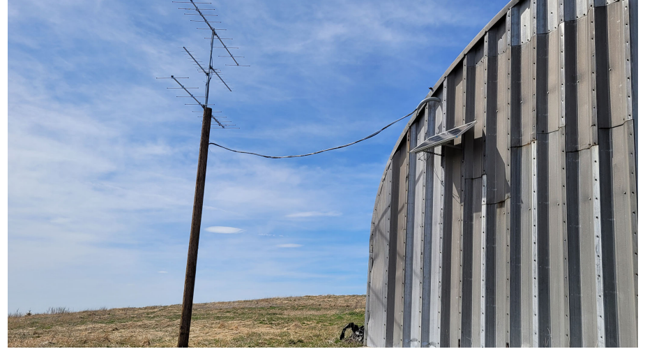
Antennas are mounted on the wood pole and the receiver station is housed inside the hangar, safe from the elements.