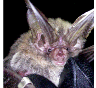
Rafinesque's big-eared bat