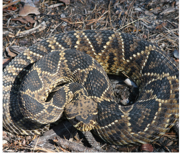
Eastern diamondback rattlesnake

James spinymussel ( Pleurobema collina ) FE Knotty elimia ( Elimia christyi ) Little-wing pearlymussel ( Pegias fabula ) FE Magnificent rams-horn ( Planorbella magnifica ) Neuse spike ( Elliptio judithae ) Purple wartyback ( Cyclonaias tuberculata ) Savannah lilliput ( Toxolasma pullus ) Slippershell mussel ( Alasmidonta viridis ) Tan riffleshell ( Epioblasma florentina walkeri ) FE Tar River spinymussel ( Elliptio steinstansana ) FE Tennessee clubshell ( Pleurobema oviforme ) Tennessee heelsplitter ( Lasmigona holstonia ) Tennessee pigtoe ( Fusconaia barnesiana ) Yellow lampmussel ( Lampsilis cariosa ) Yellow lance ( Elliptio lanceolata )