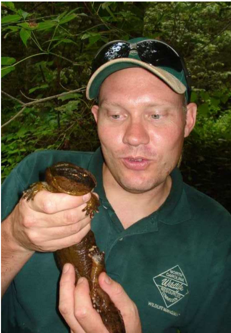
Eastern hellbender-state special concern