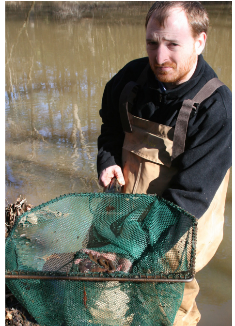
Neuse River waterdog- state special concern