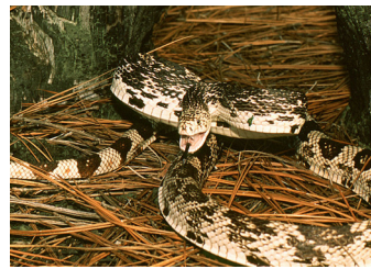
Northern pine snake