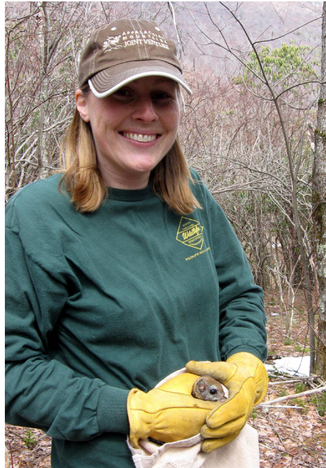
Carolina northern flying squirrel-federally endangered