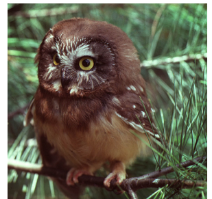
Northern saw-whet owl