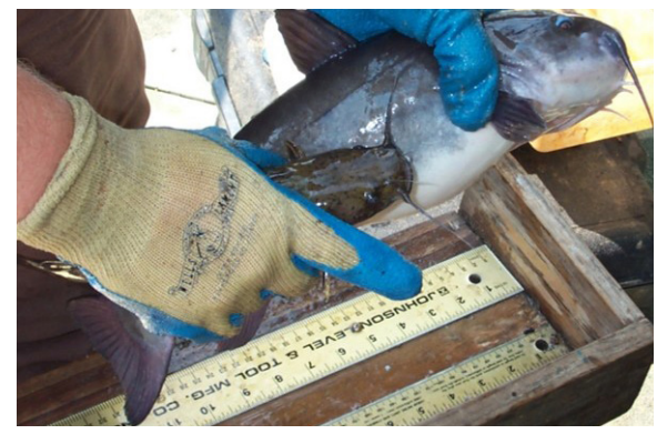
A N.C. Wildlife Resources Commission biologist measures the length of a White Catfish on the New River, NC.