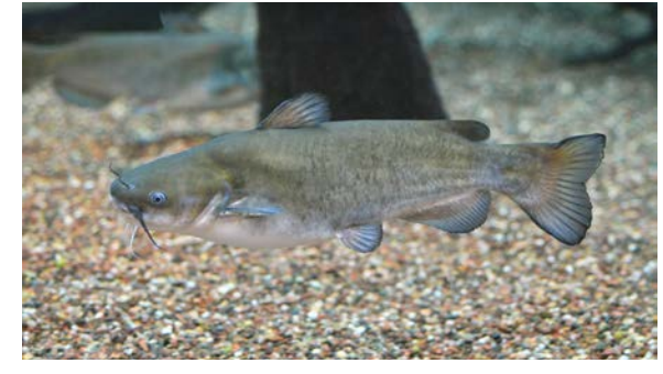
White catfish