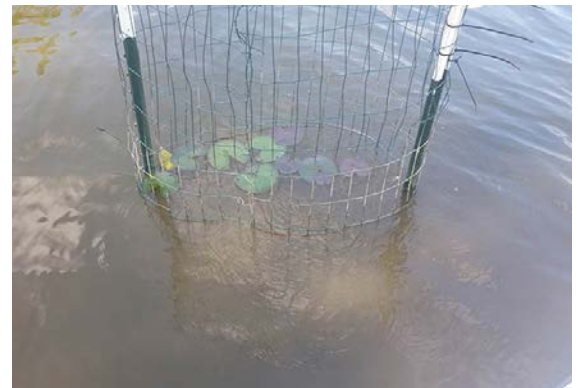
Figure 4a: Close-up view of a fenced enclosure to protect beneficial vegetation from herbivores