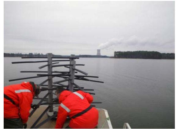
Figure 5: Example of fish attractors being placed into Harris Lake