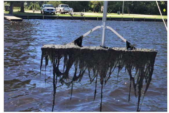
Figure 3: Lyngbya