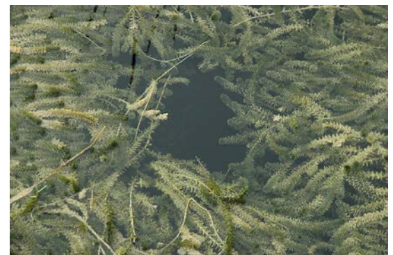
Figure 2. Hydrilla underwater