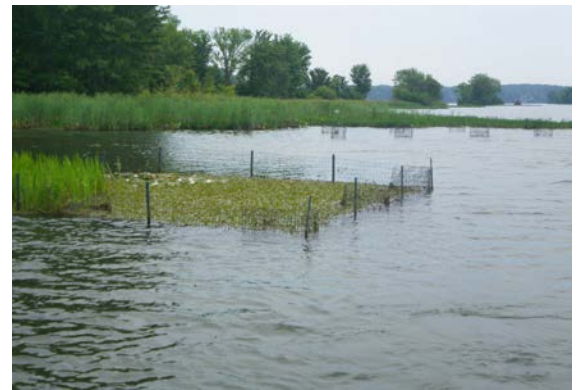
Figure 4: Example of a fenced enclosure to protect beneficial vegetation from herbivores