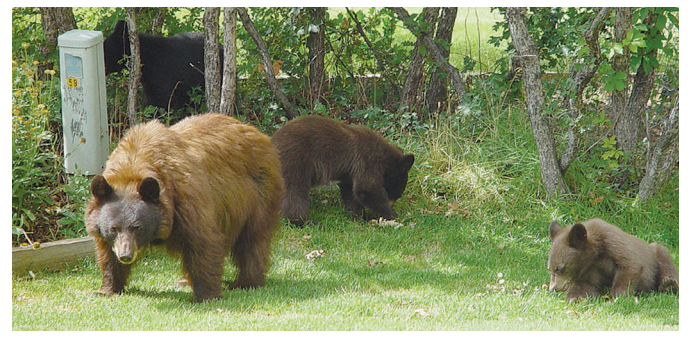
Don't force a mother black bear to defend her cubs.

If you live in or travel to bear country and own a dog, sooner or later your dog may encounter a bear. Understanding why some encounters end peacefully and others end with dogs and people being injured or killed can help keep people, dogs and bears safe.