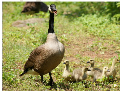
Canada goose with goslings

Monogamous—male and female usually bond for life. Male is called gander, female is called goose. Sexually mature between 2 and 3 years. Most successful breeders are 4+ years. If one dies another mate is found. Among the first birds to nest in the spring. Adults raise a single clutch each year. In southern locations, a second nest may be attempted if the first nest fails. The young are called goslings. Average clutch size of 5-14 eggs. Completed clutches range from 1-23 eggs. Incubation period is 25-30 days depending on the subspecies. Families remain together at least until after the young are able to fly and the adults have completed their molt.