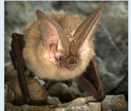
Townsend's big-eared bat ( Corynorhinus townsendii townsendii), which is similar in appearance to the Virginia big-eared bat.