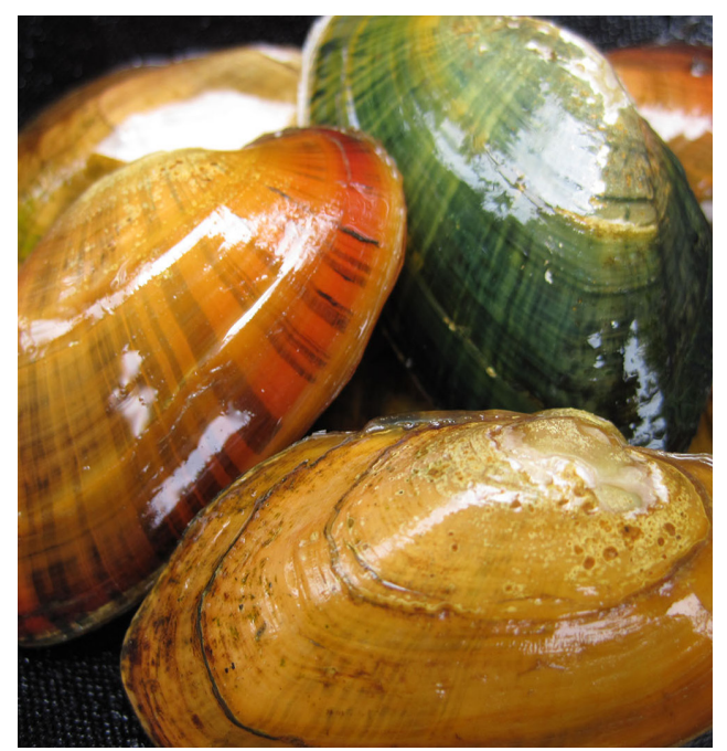
Brook Floaters from the Roaring River