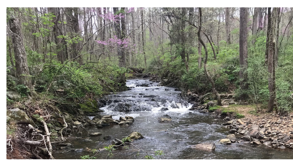
Wildlife Commission biologists conserve Brook Floaters by protecting wide, forested riparian corridors, which should be at least 100 feet for perennial streams.

Riparian buffers of at least 100 feet for perennial streams and 50 feet for intermittent streams will be recommended for most