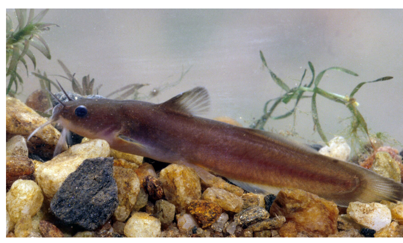
Researchers recently completed a host fish study for Brook Floater and found Margined Madtoms to be the most suitable host in North Carolina.

to support ongoing efforts to conserve Brook Floaters via translocation and augmentation of extirpated populations such as the Catawba River downstream of Lake James, Upper South Fork Catawba River (Henry and Jacob Forks), and the Upper Yadkin River upstream of Kerr Scott Reservoir. Other recent efforts have focused on limiting vehicular traffic in streams occupied by Brook Floaters, biological assistance focusing on new HQW/ORW water quality classification in occupied rivers such as the Roaring River, technical guidance to land-protection organizations purchasing tracts of land adjacent to occupied streams, and initiation of a mark-recapture study in core populations in order to track temporal changes.