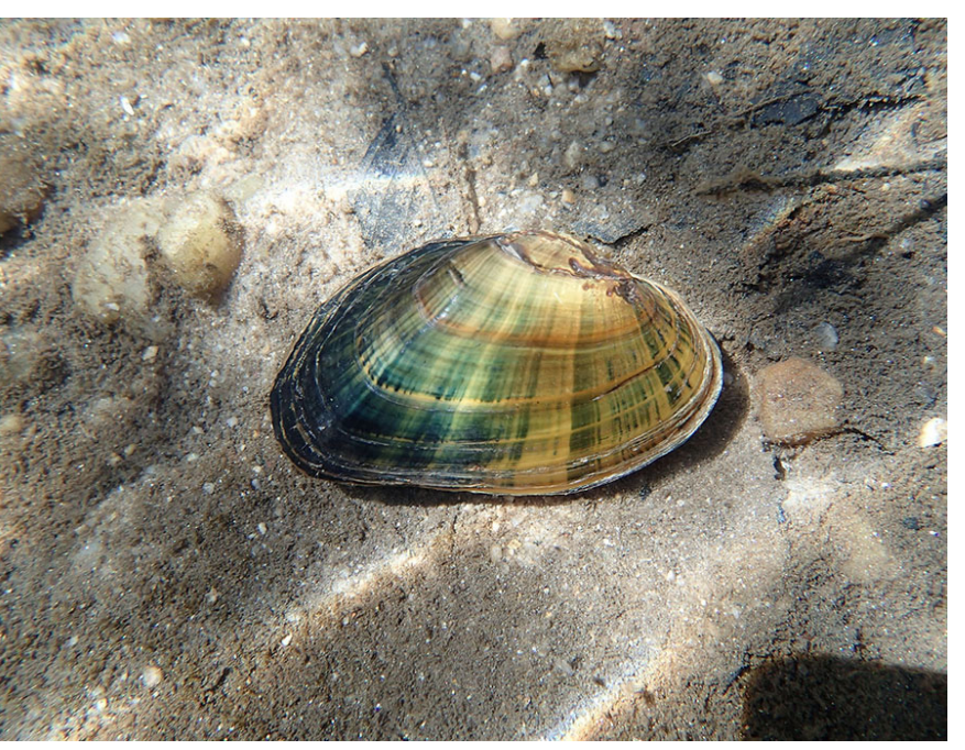
Wildlife Commission biologists are working to ensure the long-term viability of the Brook Floater.