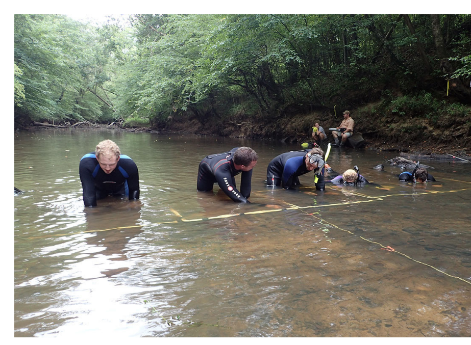
Conducting mussel surveys

discovered. By the end of 2009, 21 streams had known Brook Floater populations Still, CPUE was highly variable. The majority of sites ranged from one to three individuals and CPUE was usually less than one mussel per hour. The highest population numbers were observed in the Roaring, Yadkin and Mitchell rivers (CPUE 25.5, 14, and 13.8, respectively) in the Yadkin River Basin, From 2010-2017, more focused monitoring surveys were conducted for Brook Floaters. Over the past seven years, 16 streams have had recorded Brook Floaters in North Carolina. However, recent surveys have revealed new populations and larger distributions. Some streams have been found to have much higher densities than originally thought. The highest density population in North Carolina was discovered in 2015 in Mulberry Creek in the upper Johns River basin with CPUEs ranging