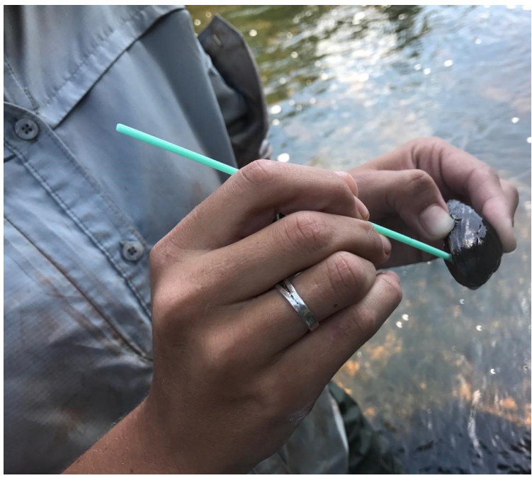
Collecting tissue from a brook floater for genetic analysis