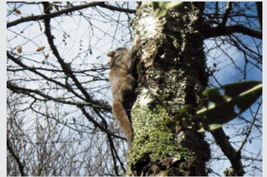
A gliding tree squirrel

The northern flying squirrel inhabits the cool, wet boreal and deciduous forests of North Carolina's highest mountains. It prefers a mix of conifers (red spruce, Fraser fir, Eastern hemlock) and northern hardwood trees (yellow birch, buckeye, sugar maple). Biologists have found that the squirrel forages in the conifers and dens in the hardwoods. Dens are found in live and dead trees and include old woodpecker cavities, rotted knotholes where branches have broken off,