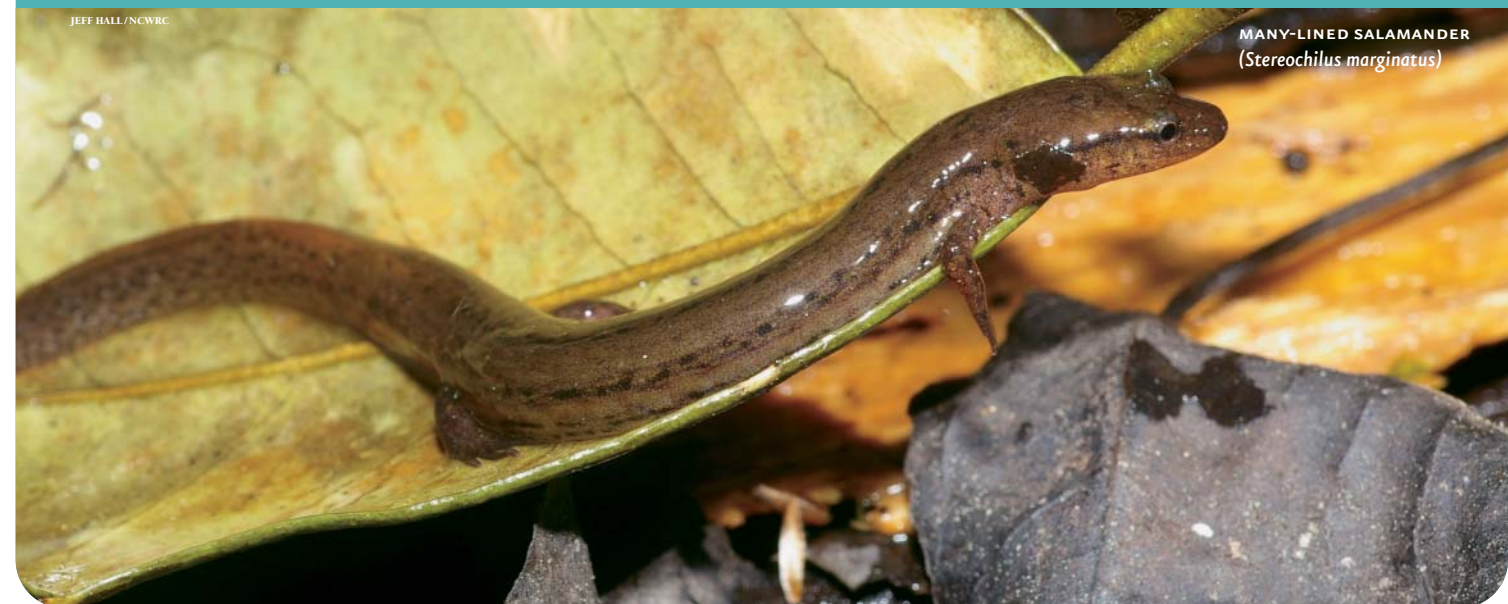
MANY-LINED SALAMANDER ( Stereoichilus marginatus )