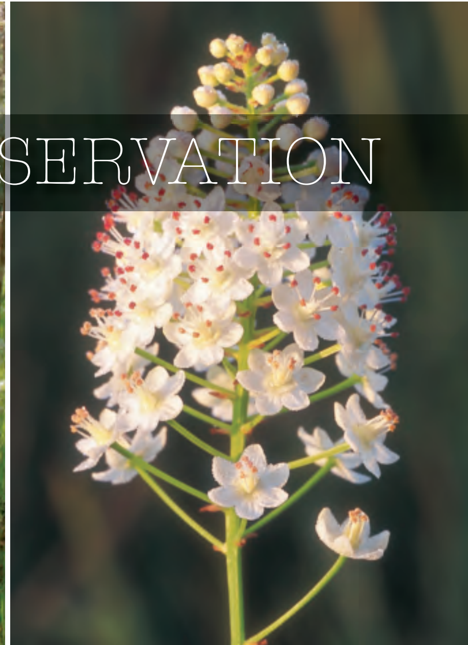
Shaken Creek Preserve contains dozens of plants found only in savanna habitat (center), such as the purple pitcher plant (left) and crow poison.

GREAT THINGS HAPPENED WHEN THE NATURE CONSERVANCY, A DEDICATED LANDOWNER, A HUNT CLUB AND THE U.S. MARINES TEAMED UP TO PRESERVE A SLICE OF PRISTINE SAVANNA IN PENDER COUNTY. THE SHAKEN CREEK PRESERVE NOW PROTECTS RARE PLANTS AND ANIMALS.