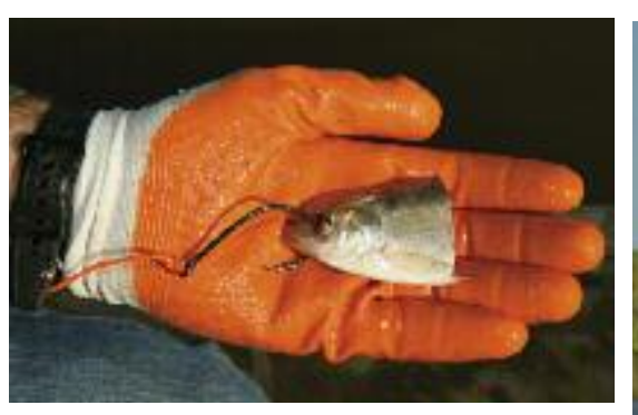
Opposite: Floats made of polyethelene foam, the same material used for swimming pool "noodles," have become popular for jug fishing. Clockwise: An "eating-size" blue catfish is ready to be netted. Max Mullins reaches for a noodle as Marcus Belote stands ready with a net. Belote and Mullins admire this 30-pounder, caught with a gizzard shad head on a circle hook, before releasing it.

hours of the morning. I went on to make some jugs out of half-gallon milk containers with screw-on tops and had some success, but not like the success Outdoors Unanimous has had at Lake Gaston.