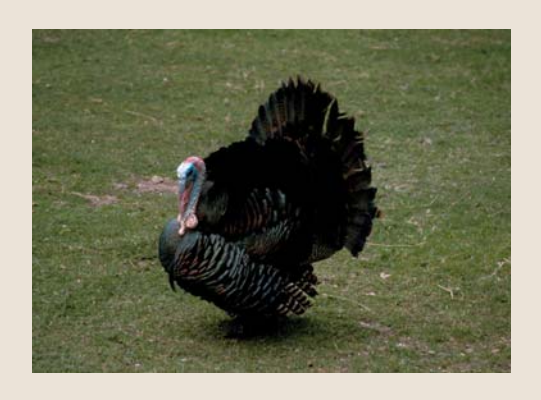
Flies at speeds up to 55 mph.

The male eastern wild turkey has dark plumage with striking bronze, copper and green iridescent colors. On the inside of their legs, males have pointed growths known as spurs that they use when battling other males for mates.